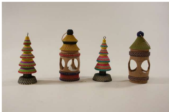
Turner of the month -