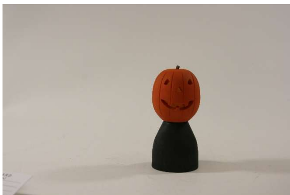
Roy Carlson - pumpkin