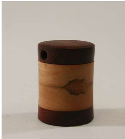
Tulip/padauk Pencil Sharpener