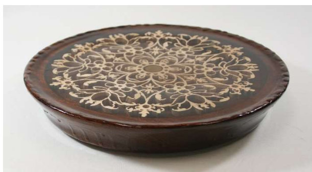
Don Keefe – sapele plate, with maple scroll saw maple