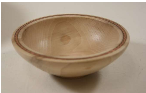
Bob Schasse – sycamore bowl with copper wire