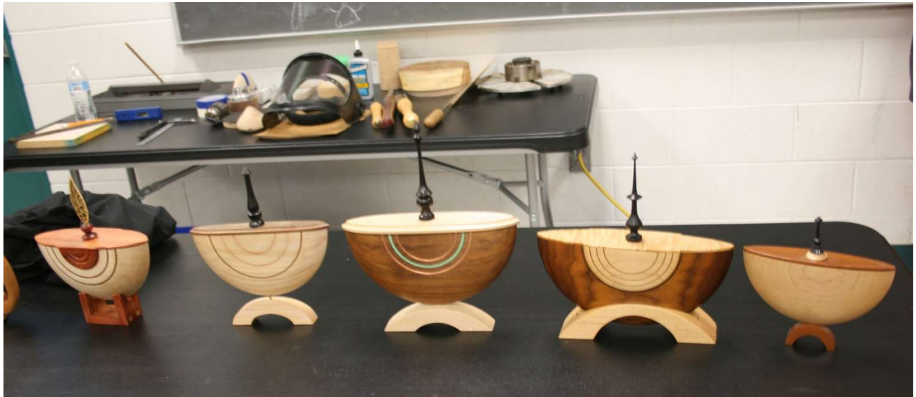
On the Demonstrator's table