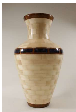
Jason Lathrop – aspen/mahogany/maple burl vase