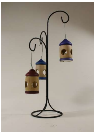
Ed Siegel – popular ornaments