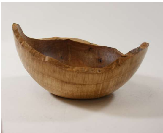
Steve Coley – maple natural edge bowl