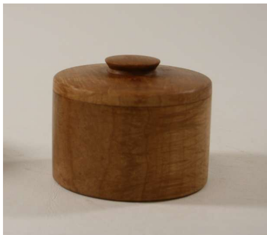
Steve Coley – maple lidded salt box