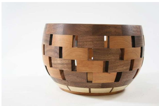
Tim Jobe – cherry/walnut open segment bowl