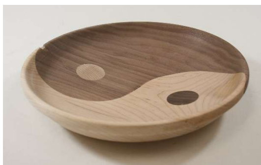
Paul Lambrecht – maple/walnut yin/yang platter