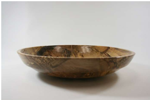
Ed Siegel – spalted ambrosia maple bowl