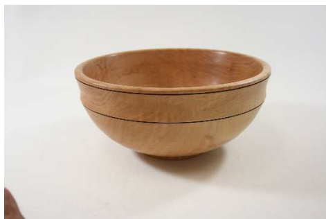
Bob Schasse – osage orange salad bowl