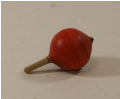
Crystal – Spinning top pumpkin