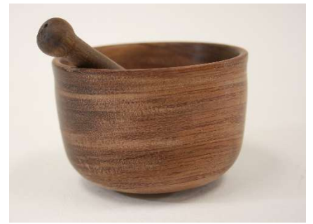
Mortar and pestle