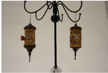
Bird house ornaments – Ed Siegel