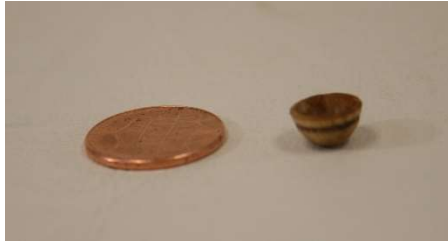
Miniature bowl – ??