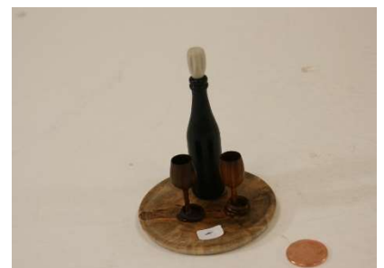
Small wine set from ebony and cocobolo – Rob Suggs