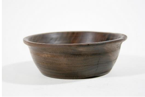
Carol Hansen – 6” Black Walnut Bowl