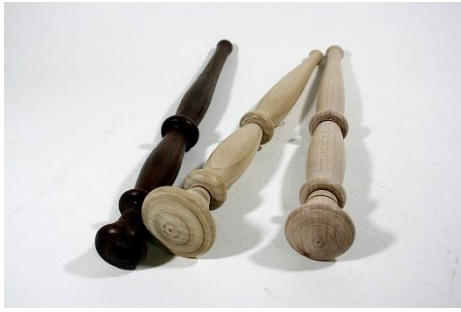
Bob Moffett – Walnut, Poplar and Maple Spurtle