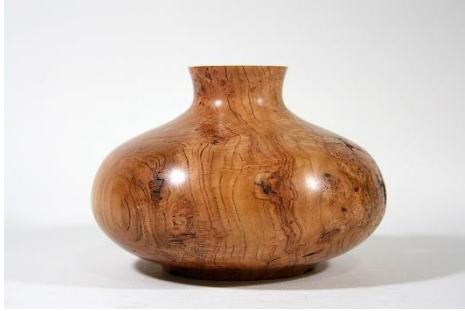
Geoff Purser – 7” Cherry Burl Hollow Vessel