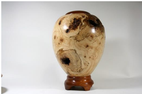
Earl Kennedy - Vase