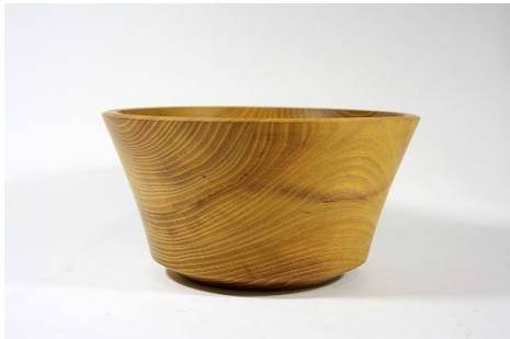
Scot Brown – Osage Orange Bowl