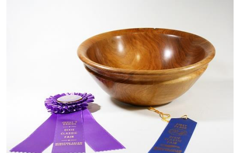
Dallas Stokes – Black Cherry Bowl – Dixie Classic Fair winner