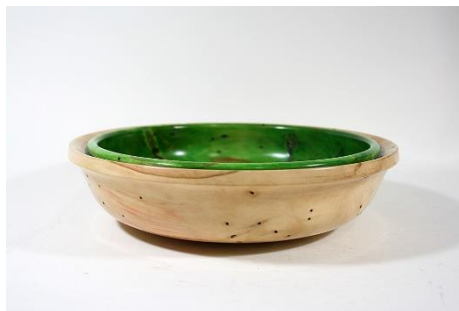
Earl Kennedy – Maple Bowl-in-Bowl