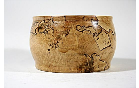
Jim Yarbrough – 5” Spalted Maple Bowl