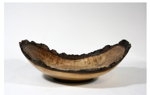
Bob Moffett – 10” Walnut Bowl