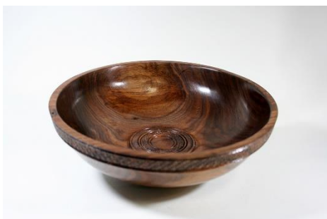
Bob Moffett - 14” Walnut Bowl