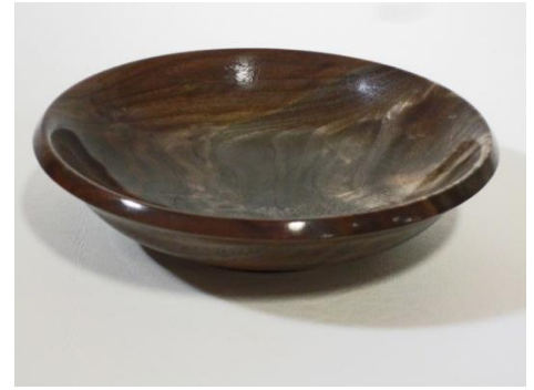
Doc Green – 5” Walnut Bowl