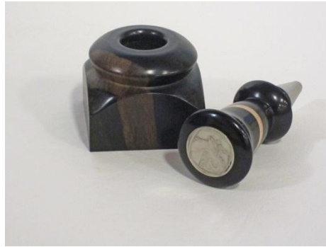
Jim Barbour – African Blackwood & Maple Bottle Stopper