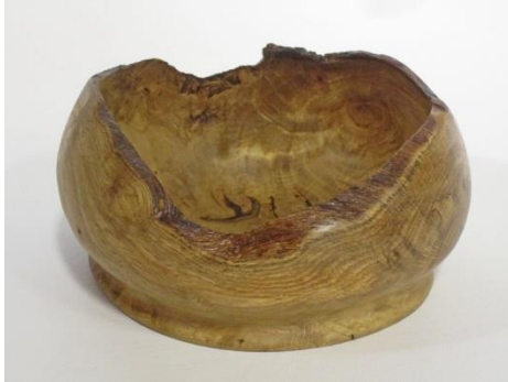
Matt Larsen – 8” White Oak Bowl