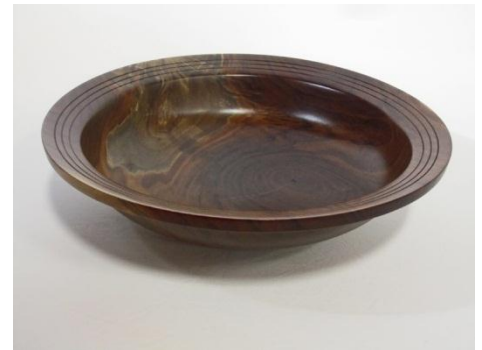
Chuck Waldroup – Walnut Bowl