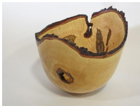
Chuck Waldroup – Natural Edge Maple