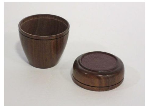
Nim Batchelor – 4” Walnut Box