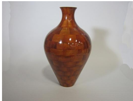
Floyd Lucas – Maple Vase