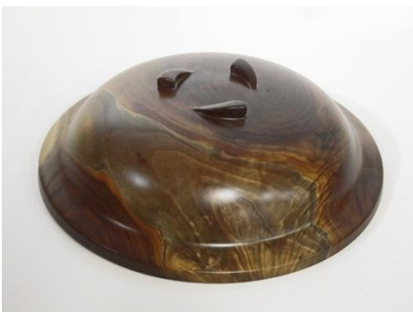
Chuck Waldroup – Foot of Walnut Bowl