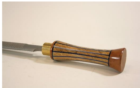
Handle for Wood Rasp – Jason Lathrop - Blistered & Spalted Maple