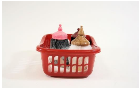
Basket of Gnomes (4) – Bob Holtje Mixed wood