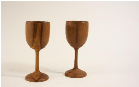
Two Goblets – Charles Hepler - Apple