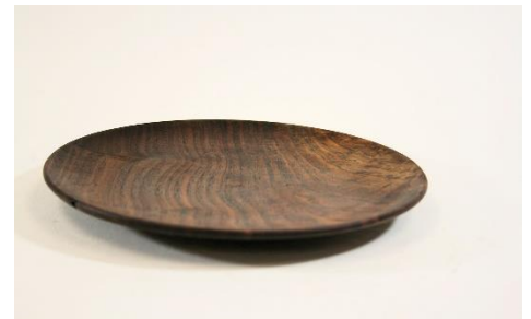
Walnut Plate – Jim Yarbrough