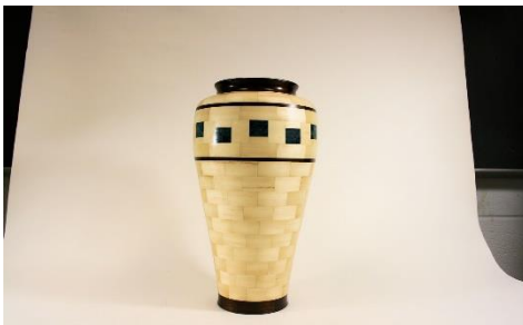
Segmented Vase – Jason Lathrop Aspen, Peruvian Walnut, Maple Burl