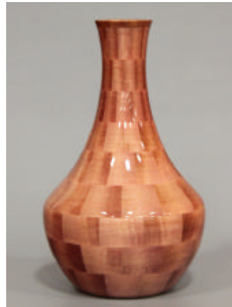
Floyd Lucas – Maple Segmented Vase