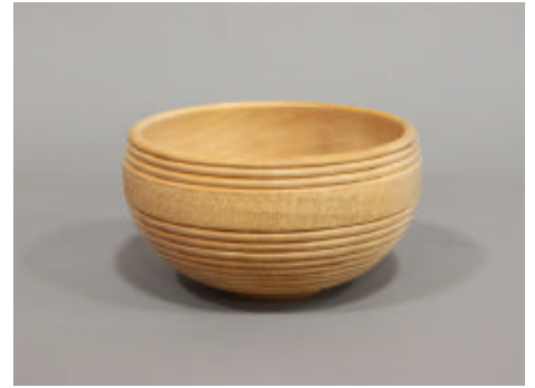
Pat Lloyd – Beaded Red Maple Bowl