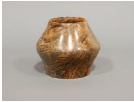
Jim Yarbrough – Ambrosia Maple Hollowform