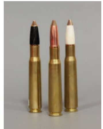
Scot Conklin - .50 Cal Copper Stag Antler, Buffalo Horn Pens