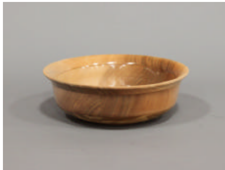
Bert Rau – Lake Superior Birch Bowl