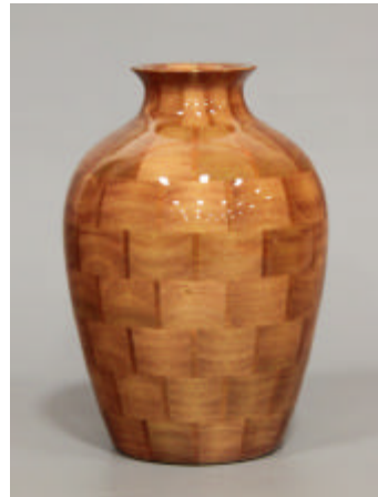
Floyd Lucas – Poplar & Cherry Segmented Vase