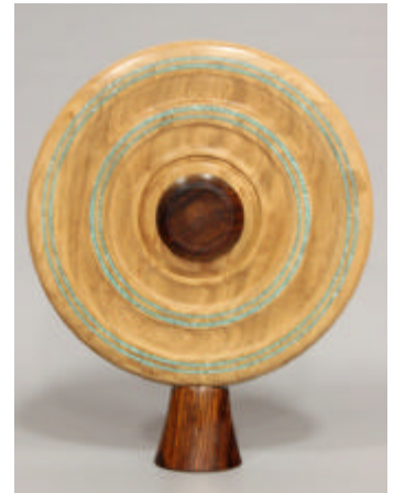
Bill Oliver – Oak Cocobolo Turquoise Platter