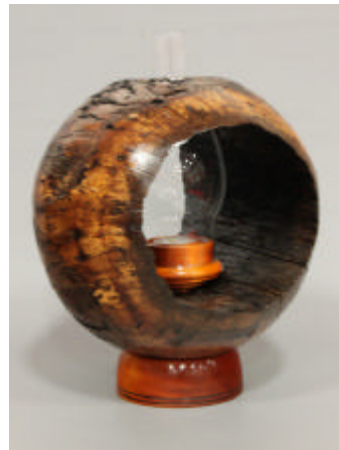
Earl Kennedy – Maple Squirrel Lamp