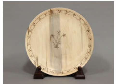
Clyde Mosley – Ambrosia Maple Plate