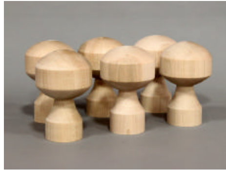
Earl Kennedy – Maple Legs