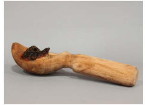
Bruce Schneeman – Red Oak Scoop