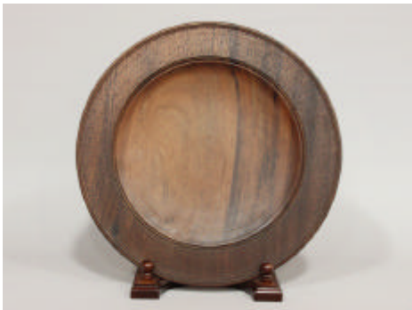
Butch Hadley – Brazilian Walnut Platter