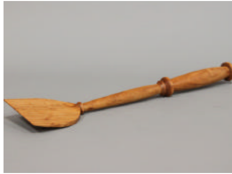
Earl Kennedy Maple Spatula