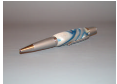
Paige Cullen – Acrylic Wall St.II Pen