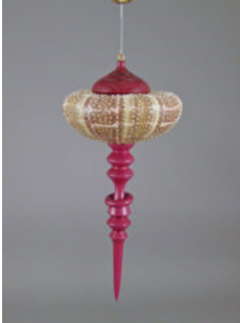
Tom Danek – Purpleheart Sea Urchin Ornament