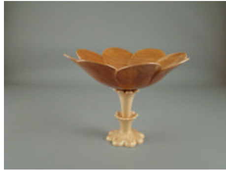
Earl Kennedy – Blooming Goblet