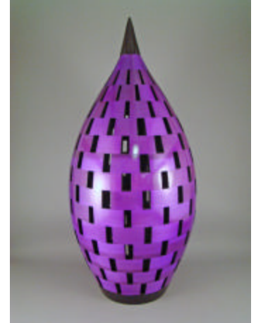
Jack Walters – Maple Open Segment Vessel