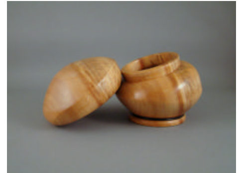
Jim Duxbury – Camphor Two-Axis Box