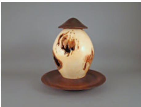
Lan Brady - Bird House