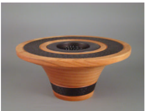
Pat Lloyd – Ikebana – Cherry w/ Black