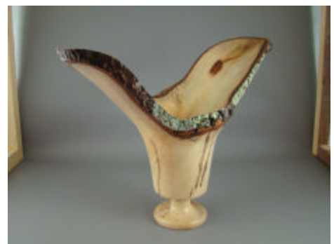
Earl Kennedy – Crotch Vase