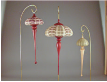
Bob Moffett – Maple & Purpleheart Sea Urchin Ornaments