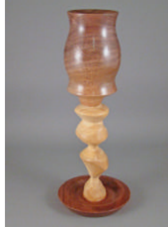
Carter Deaton – Multi-Axis Cup