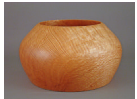
Jim Yaibrough – Lacewood Hollow Form