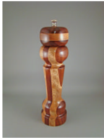
Gene Briggs – Walnut & Maple Peppermill