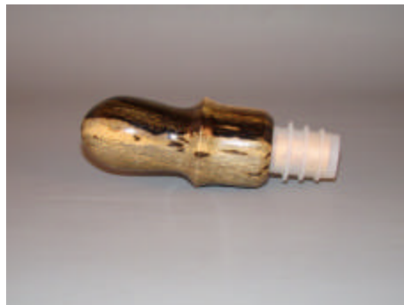
Paige Cullen – Black & White Ebony Bottlestopper