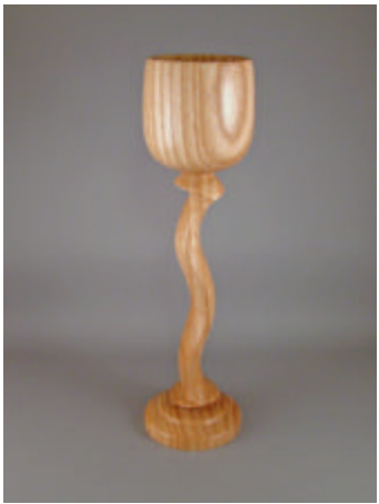
Larry Dodson – Ash Two-Axis Turning