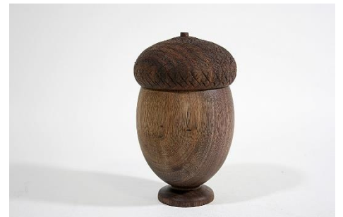
Jerry Jones – 4” Acorn Box w/ Threaded Lid