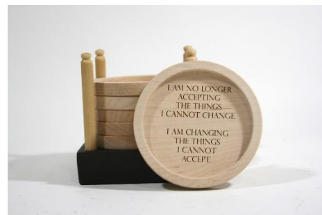
Nim Batchelor – 3” Maple & Walnut