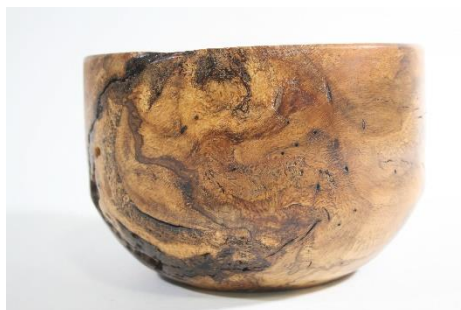
Jim Yarbrough – 8” Oak Bowl