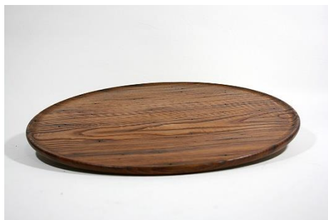
Jim Yarbrough – 13” Wormey Chestnut