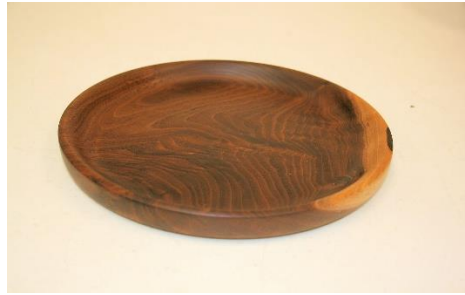
Plate – Roy Carlson - Walnut