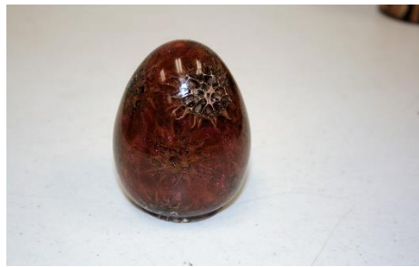
Egg – Resin - Fran Bass