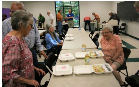
Everyone enjoying their meal.