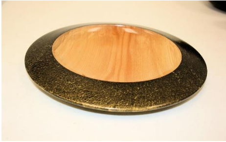
Platter – Beech – Jason Lathrop