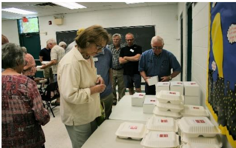
A boxed meal was provided by the club.