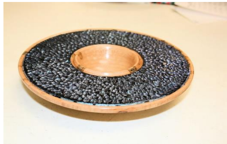
Blue Textured Bowl – Maple – Bob Moffett