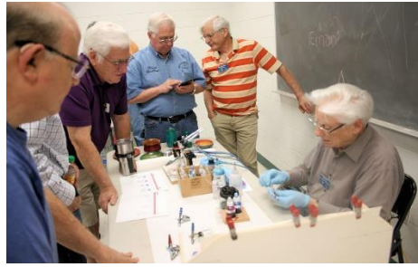
Members showing interest in Air Brush demo