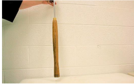
Tool Handle - Shedva