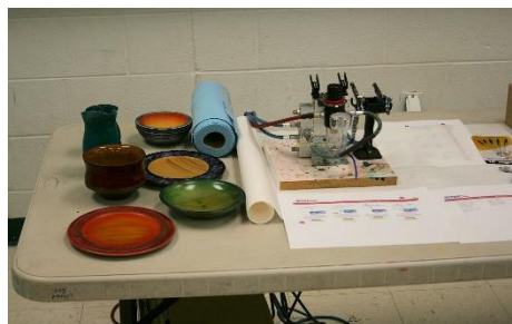
Air Brush Demo table – Jim Terry