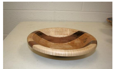
Bowl – Various Wood – Nick Poschl