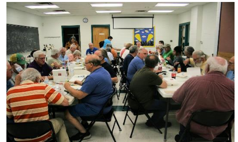
A good group gathering.