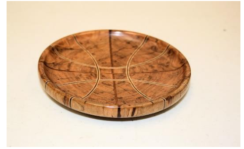
Dish – Multiple Woods – Jason Lathrop