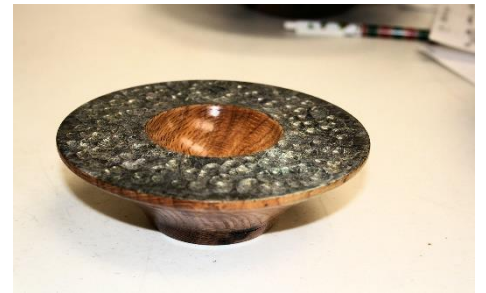
Painted Textured Bowl – Oak – Bob Moffett