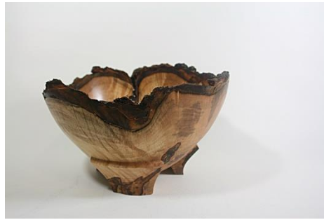
Dean Hutchins – Maple Natural Edge