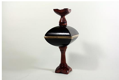
Robert Lunsford – 4” Basswood, Walnut 5-Axis Bowl