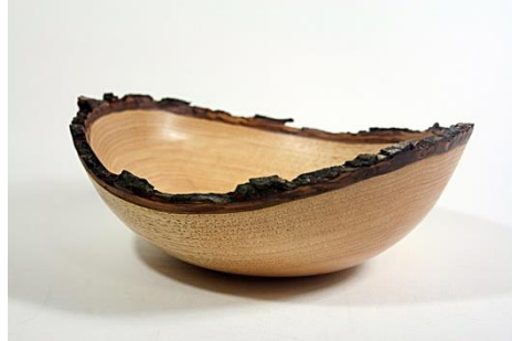
Milt Transou – 9” Hickory Natural Edge Bowl