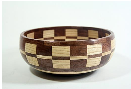
Bob Schasse – 9” Ash & Walnut Bowl