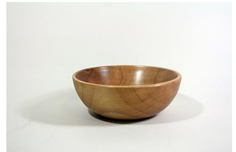
Jim Yarbrough – 6” Maple Bowl