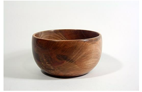
Milt Transou – 5” Maple Bowl