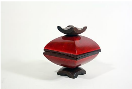
Robert Lunsford – 5” Poplar, Walnut, Cedar 5-Axis Pedestal Bowl