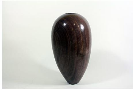
Geoff Purser – 10” walnut Hollow Form