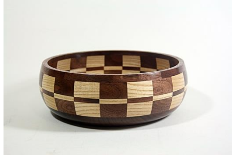
Bob Schasse 9” Ash & Walnut Bowl