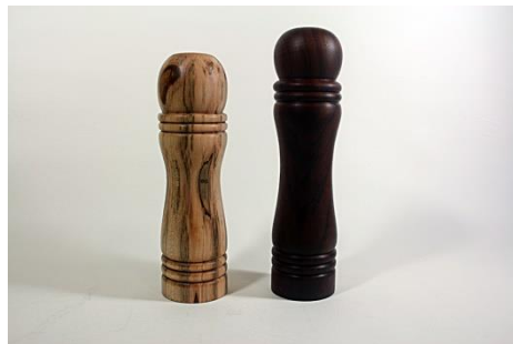
George Sudermann – 10" Amb Maple, Walnut Salt & Pepper Mills