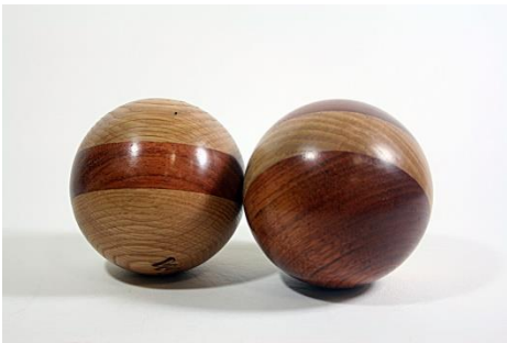
Jim Barbour – 4” Oak & Brazillian Cherry Bocce Balls