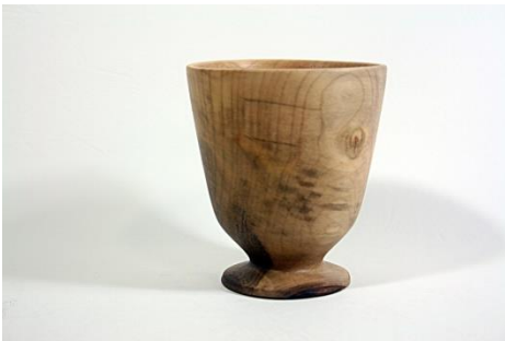
Harry Sample – 5” Poplar Open Vessel