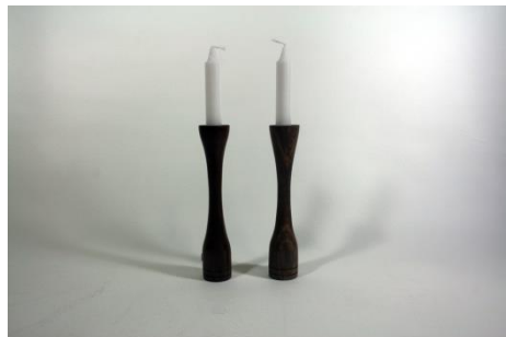
Tim Smith – 7" Walnut Candlesticks