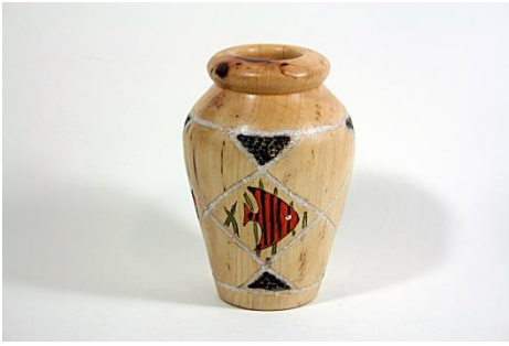
Milt Transou & Dave MacInnes – 4” Basswood/Walnut Decorated Vase