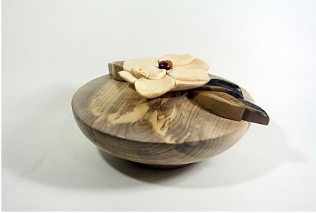
Earl Martin – 10” Magnolia on Magnolia Box