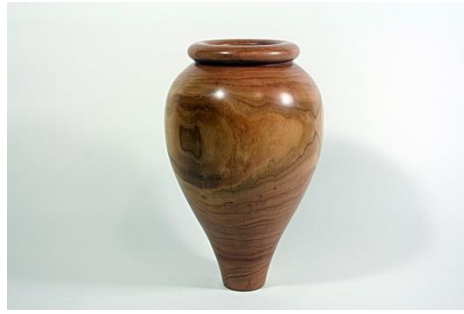
Milt Transou – 8” Cherry Hollow Form