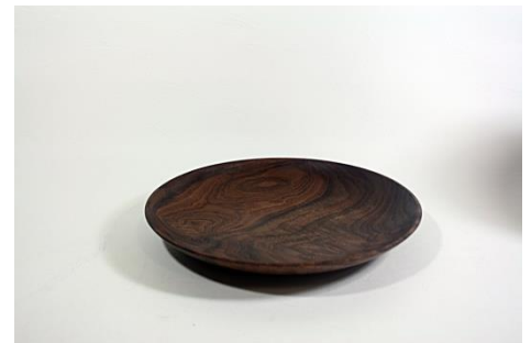
Nim Batchelor – 10” Walnut Plate