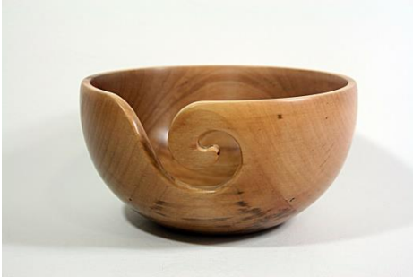
Milt Transou – 7” Maple Yarn Bowl