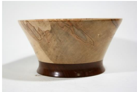
Greg Ford – Maple & Mahogany Bowl