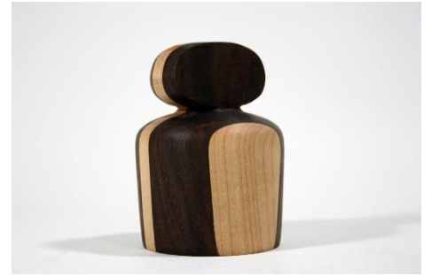
Dave MacInnes – Maple/Walnut Biscuit Cutter