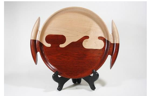
Jim Duxbury 12” Bloodwood & Maple Puzzle Tray