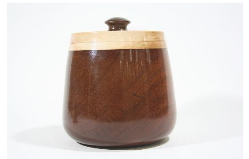
David Kelly – 5” Sweet Gum 7 Maple Box