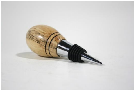
Jim Yarbrough -Spalted Maple Bottle Stopper