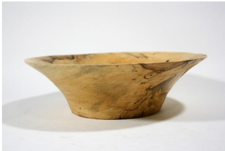
Greg Ford – Black Gum Tupelo Bowl