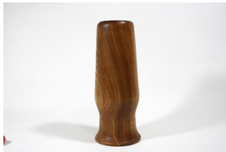
Jim Yarbrough – 9” Walnut Vase