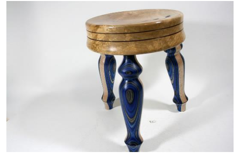
Jim Duxbury - 9” Maple & Died Burch Stool