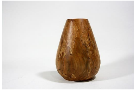
Geoff Purser – 6” Pear Vase