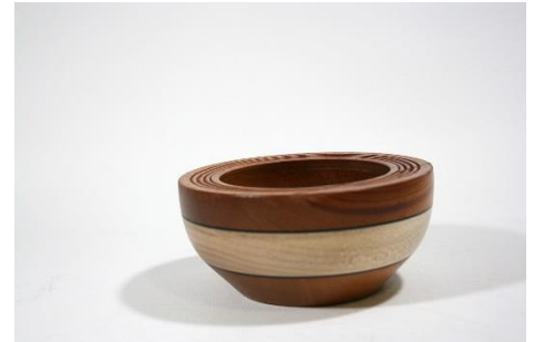
Rita Duxbury – 5” Mahogany & Maple Bowl