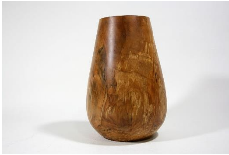
Geoff Purser – 8” Pear Vase