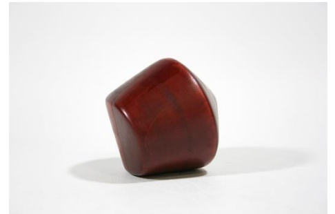
Roy Carlson – 3” Basswood Pentagonal Streptohedron