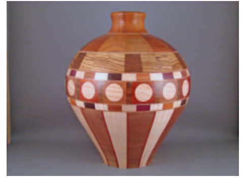
Vicki Turner – Segmented Vessel