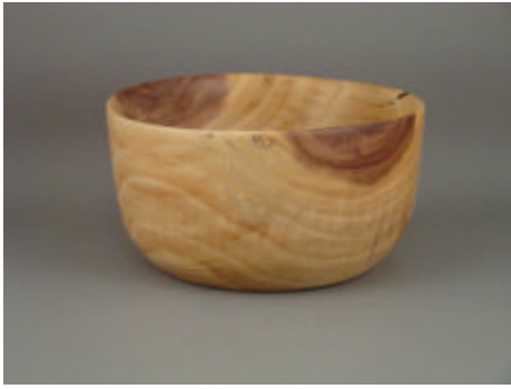
Bill Voss – Walnut Bowl