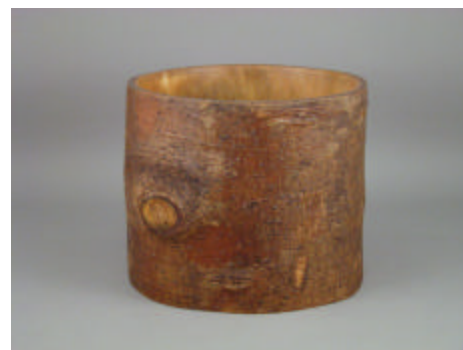
Phil Atkins – Cherry Cup w/ Natural Sides