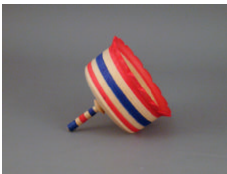
Earl Kennedy – Finger Top