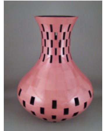
Jack Walters – Maple Segmented Vessel