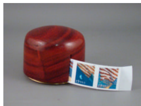
Jim Yarbrough – Padauk Stamp Holder