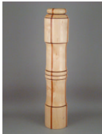
Bruce Schneeman – Maple & Mahogany Pepper Grinder