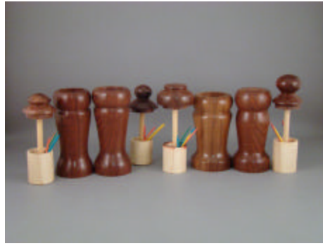
Gene Briggs – Walnut Toothpick Holder