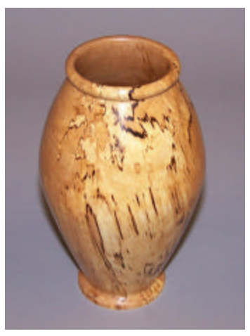
Lan Brady - Birch Vase