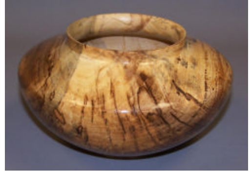
Gene Briggs - Spalted Pecan