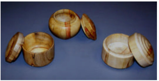
Jimmy Tuttle – Boxelder Boxes