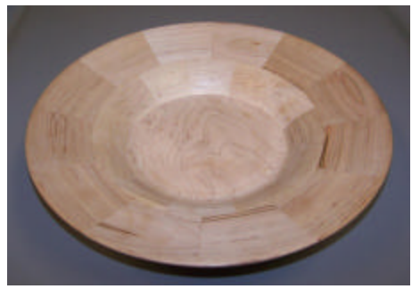
John Morris - Maple Collection Plate