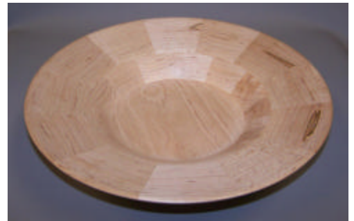
John Morris - Maple Collection Plate