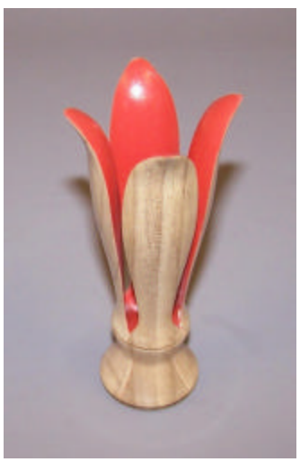
Bert Rau - Inside Out Turning