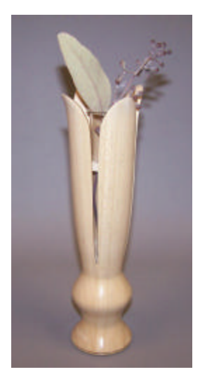
Bert Rau – Inside Out Turning