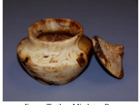
Jimmy Tuttle - Mistletoe Box