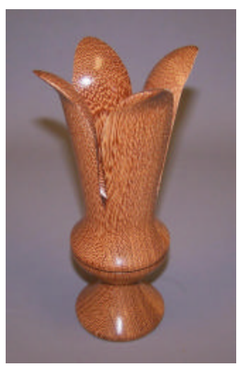
Bert Rau – Inside Out Turning