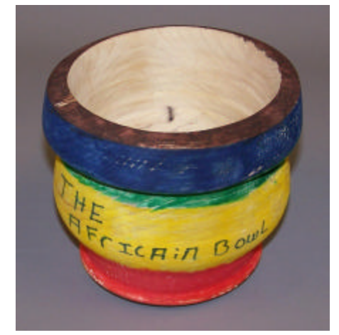
One of Phil Atkins' Students Poplar Bowls