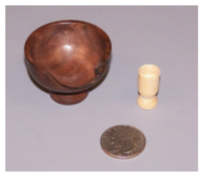
Phil Atkins – Mini Walnut & Birch Turnings