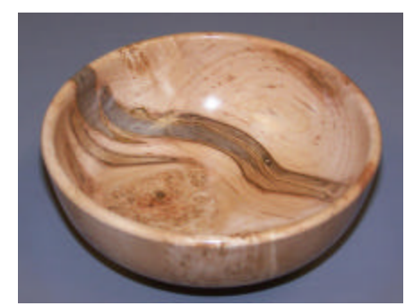
Mike Evans – Figured Maple Bowl