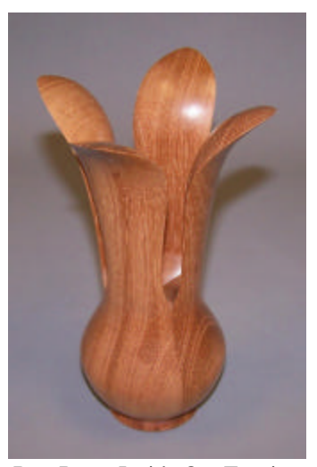
Bert Rau - Inside Out Turning