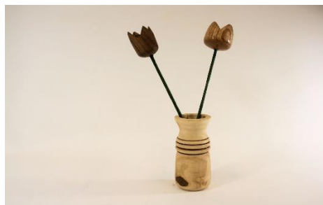
Flower Vase and Flowers – Ken Sunshine