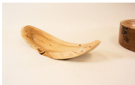
Cypress Bowl – Greg Ford