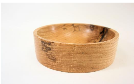
Oak Bowl – Greg Ford