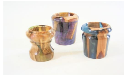
Resin and Wood Candle Holders - Franchouce