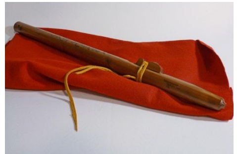
Hugh Grow – Eastern Red Cedar & Turquoise Flute