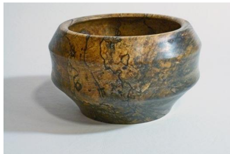
Jim Yarbrough – Spalted Maple Bowl