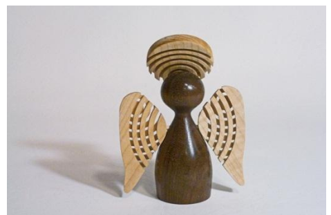
Dean Hutchins – Walnut Maple Angle