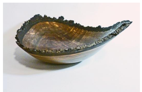
Bob Moffett – 12" Natural Edge Oak