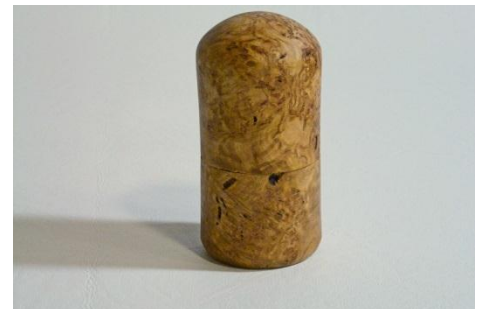
Jim Yarbrough – Eucalyptus Burl Box