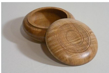
Bob Moffett – 4" Maple Box