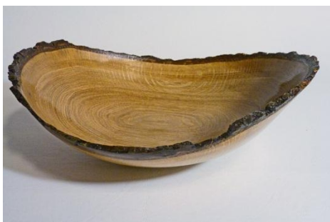
Bob Moffett – 18" NE Walnut