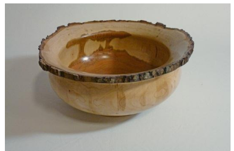
Doc Green – 11" Cherry Natural Edge Bowl