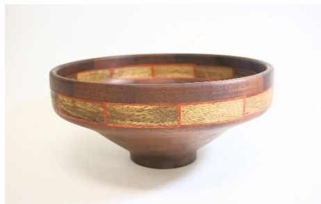
Segmented Bowl – Peruvian Walnut, Black Limba & Bloodwood – Jason L.