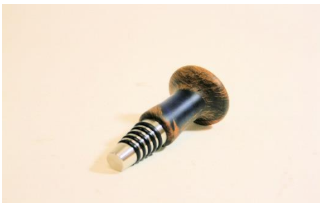
Bottle Stopper – Spalded, curly oak & Resin – Jason Lathrop