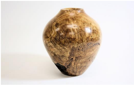
Oak Hollow Form – Rick A