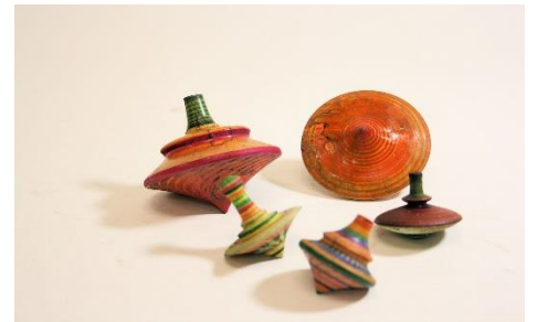
5 Tops – Geoff Purser