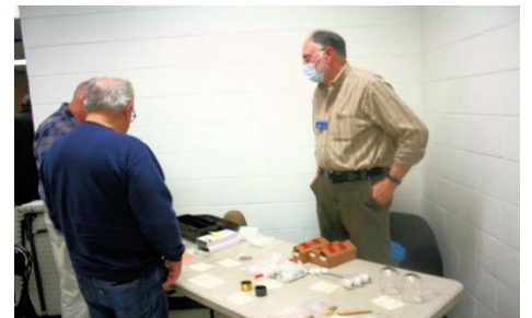
Items from Previous Turner