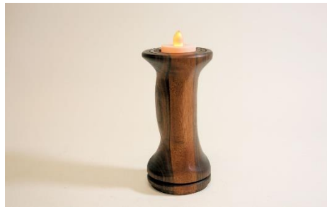
Candle Holder – Walnut – Nick Poschl