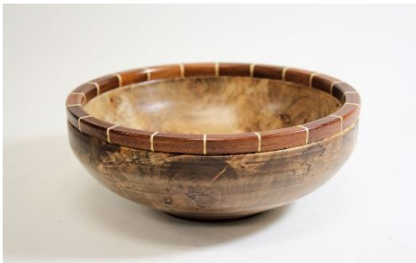
Bowl – Spaulded Maple w/Mahogany – Nick Poschl