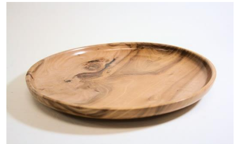
Cherry Plate – Bob Schasse