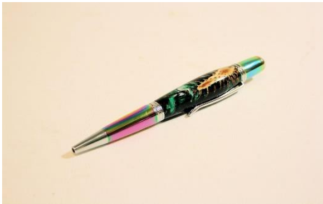
Pine Cone Pen – Resin & Pinecone Tim C