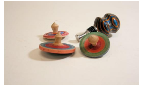
Three tops and wine stopper – Maple, colored plywood – Mike Loeberbury