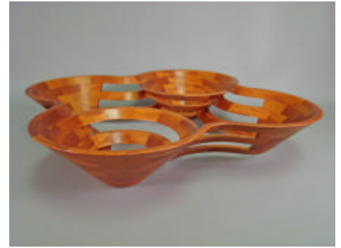
Glen Marceil – Andiroba Wood Sculpture View 2