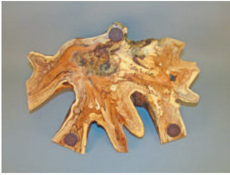
Carter Deaton – Dogwood Stump Base