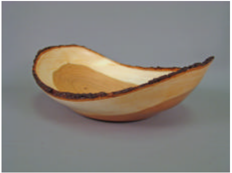
Carter Deaton – Natural Edge Cherry Oval Bowl