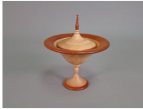
Earl Kennedy – Lidded Box with Finial