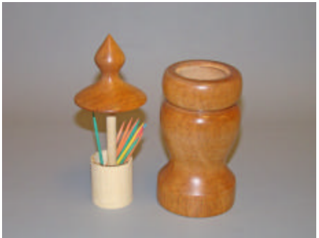
Gene Briggs – Mahogany Toothpick Holder