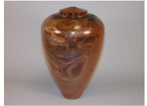
Bob Moffett – Walnut Hollow Form