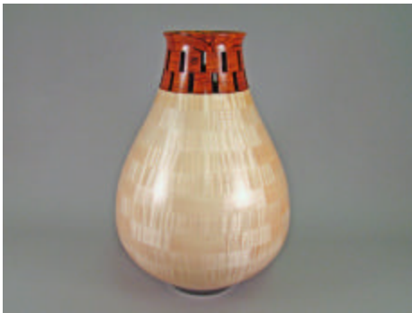
Jack Walters – Curly Maple & Cocobolo Hollow Form