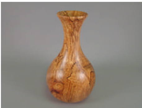
Jim Terry – Spalted Maple Hollow Form