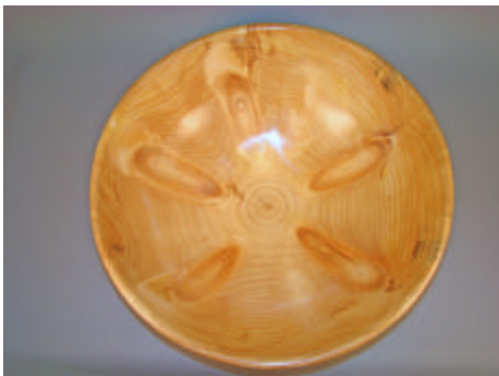
Earl Kennedy – White Pine Bowl view 2