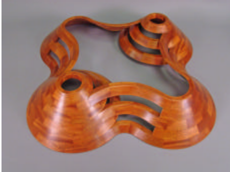
Glen Marceil – Andiroba Wood Sculpture View 3