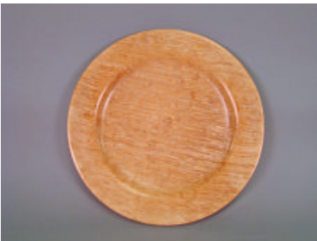
Carter Deaton – Curley Maple Plate