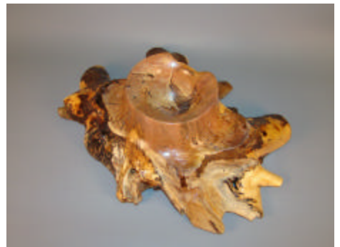
Carter Deaton – Dogwood Stump