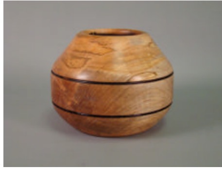
Jim Yarbrough – Maple Hollow Form