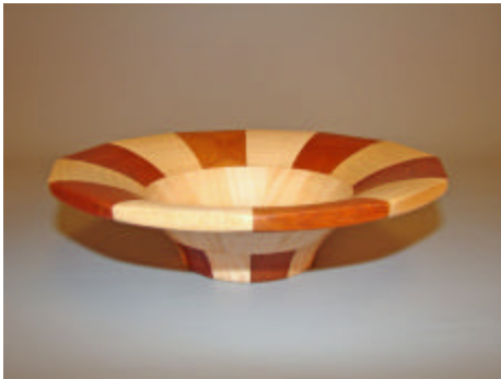
Bill Voss – Walnut & Maple Segmented Bowl