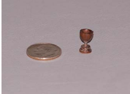
Earl Kennedy's enormous walnut goblet with captured ring - Next time make it natural edge