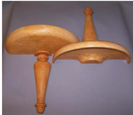
Phil Atkins wall pieces (turn one, cut in half to get two!)