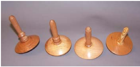
Butch Hadley's mahogany tops for tots