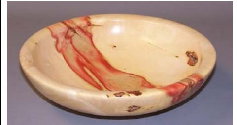
Mike Evans boxelder turned fresh off the tree