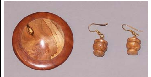
Vicki Tanner Maple burl earrings and pendant