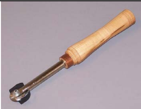
Cutting tool type A texturing tool by Barry Reeves in Miami Fl