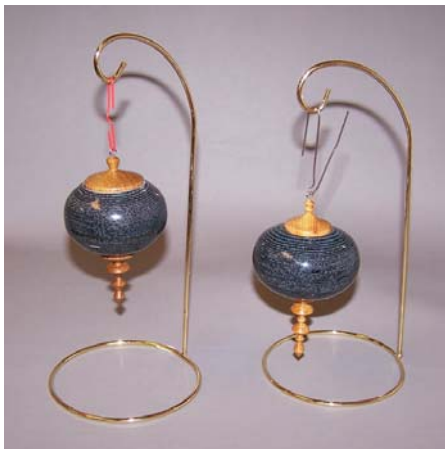
Lan Brady's ingenious epoxy denim ornaments