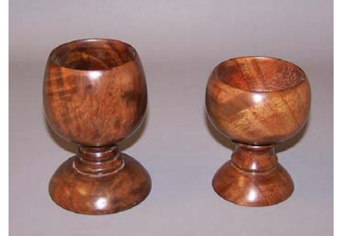
Jim Barbour walnut goblets