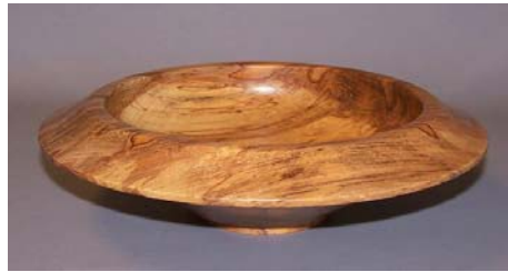
Roy Fischer maple bowl