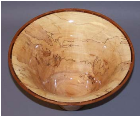
Earl Kennedy spalted maple with inlay