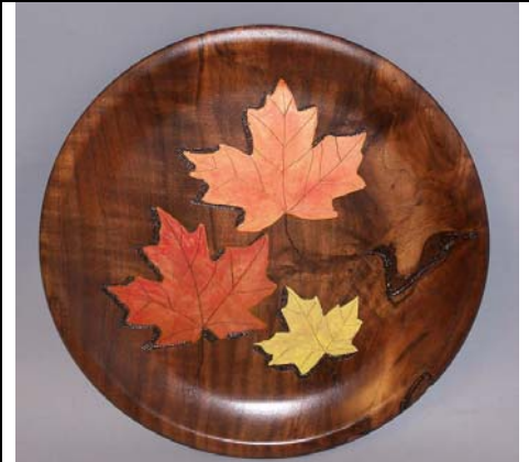
Vicki Tanner walnut platter