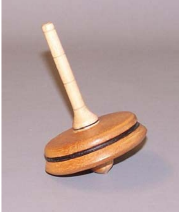
Jim Duxbury mahogany top