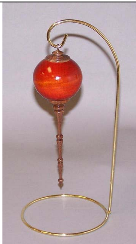
Bob Moffett Polynesian palm nut and walnut ornament