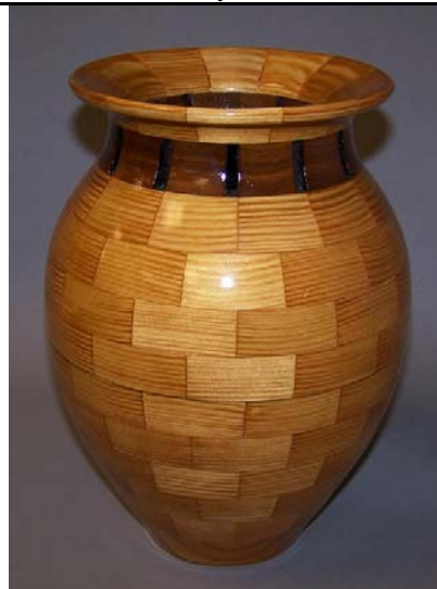
John Morris pine walnut closed segmented vessel