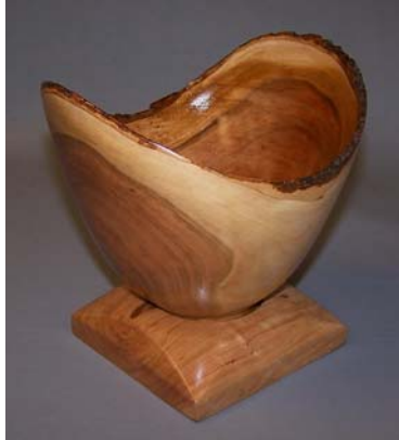
Jimmy Tuttle natural edge cherry bowl with cherry stand