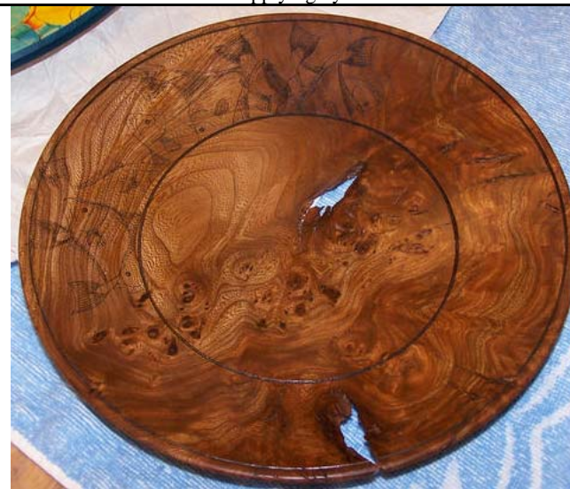
Pyrographically drawn lines (upper left)