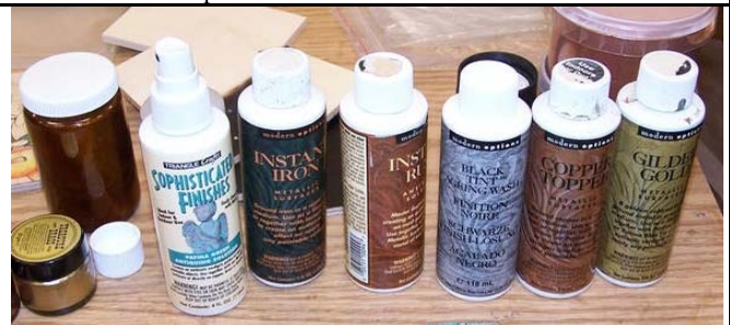
Some of the products she uses