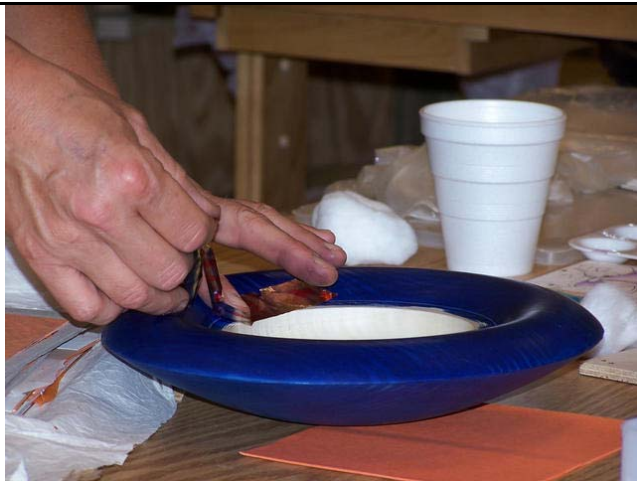
Applying metal foil to inside rim