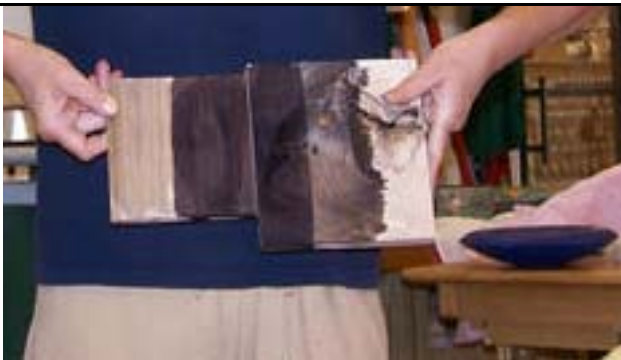
Pieces of maple she showed how to ebonize