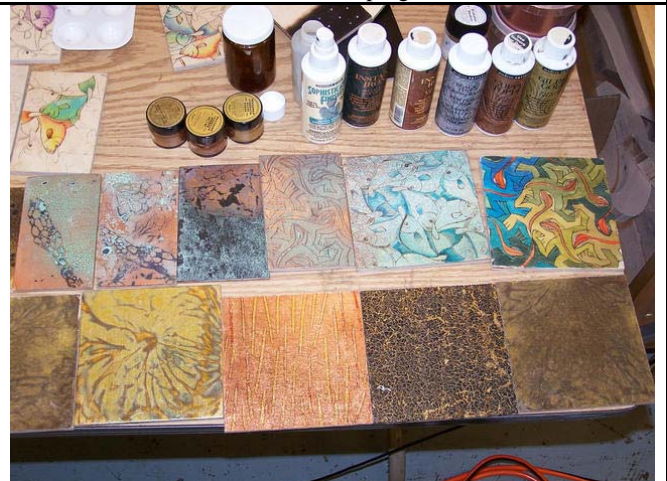
More examples of effects of chemicals on metal foils