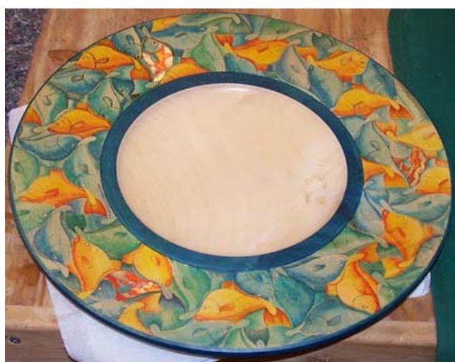
Pyrographically drawn lines & brushed dyes