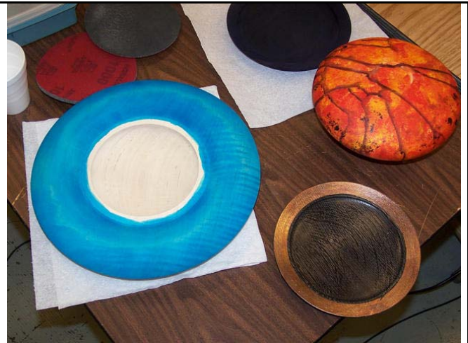
Some works in progress