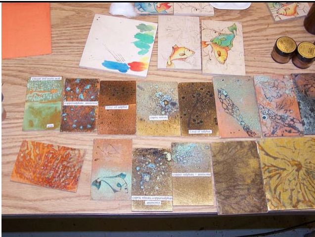
Examples of chemical treatments to metal foils