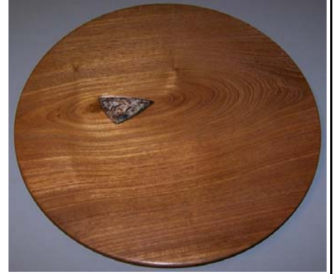
Jim Barbour, Djati teak plate with precious stone