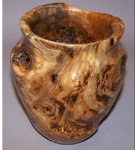
Jimmy Tuttle, Mistletoe burl