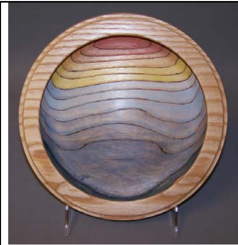
Vicky Tanner, Ash painted plate