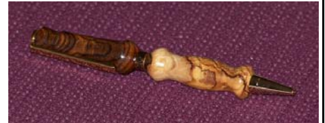
One of Paige's finished pens