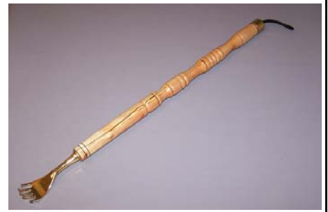
Jim Schoonard, Maple backscratcher