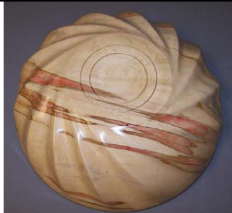
Earl Kennedy, Boxelder spiral bowl bottom