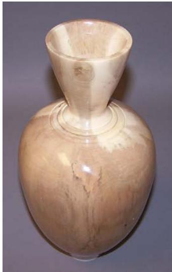
Edgar Ingram, Magnolia Vase