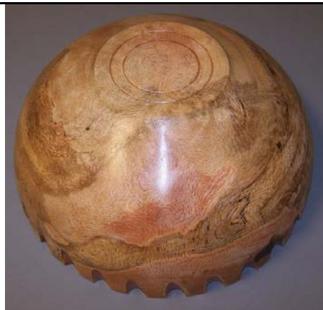
Earl's burl bowl bottom