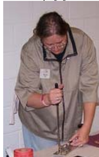
Paige pressing the pen together

For a finish, Paige uses a product called Armor Seal (spelling not to scale). Then she finishes with two good coats of Friction Polish. Using a paper towel, she buffs the finish. She concludes by buffing with lambs wool or a chamois to achieve a very high gloss.