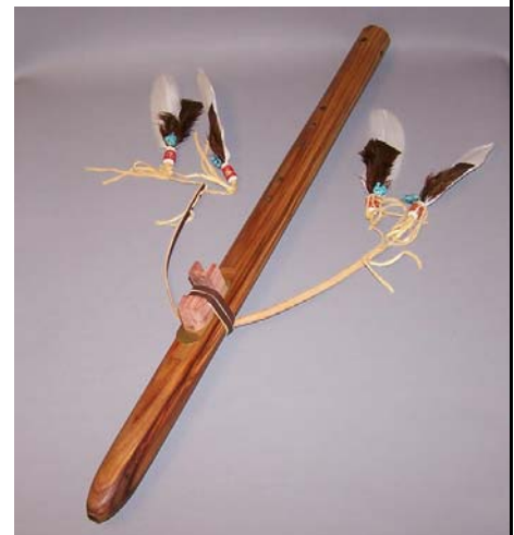
Chet Greathouse, Canary wood Native American flute