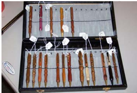
Some Paige's finished pens