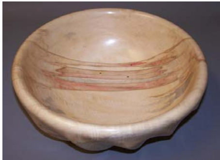
Earl Kennedy, Boxelder spiral bowl