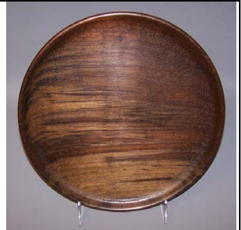
Allen Nickles, Peruvian walnut