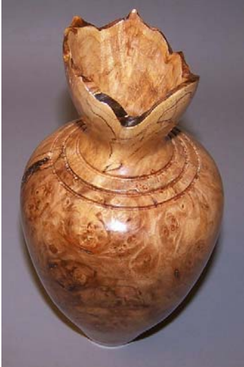
Edgar Ingram, Big leaf maple vase