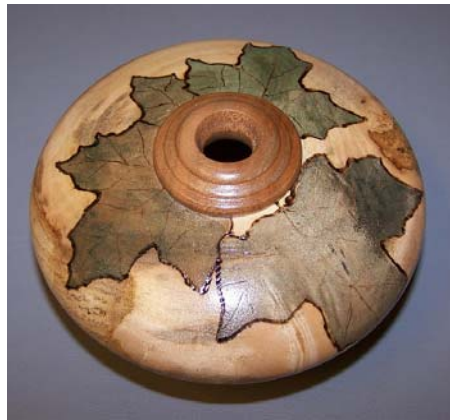
Vicky Tanner, Maple painted vessel