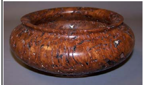
Edgar Ingram, Eucalyptus bowl