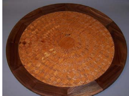
Lan Brady, polychromatic Mahogany platter