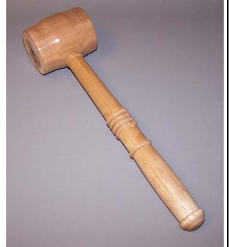
Gene Briggs, Dogwood-maple mallet