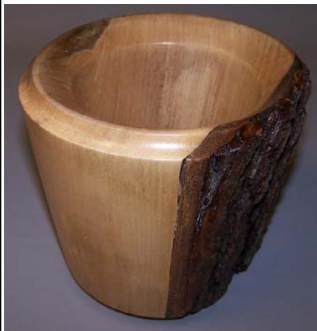
Jim Duxbury, Maple natural side bowl