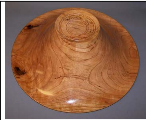
Bob's cherry bowl from below