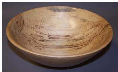
Bob Moffet, Spalted maple