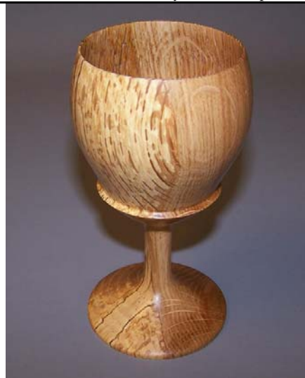
Lan Brady, Oak Goblet