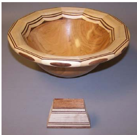
Jim Schoonard, Cherry & maple bowl with example of a segment