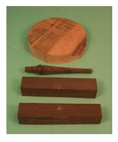
Miniature Stool 1

Maple seat planed or sanded flat on the bottom side 1/4" x 6 ½ " x 6 1/2" Walnut or Padauk Legs 1" x 1" x 6 1/2" Walnut or Padauk button 1 1/4" x 1 1/4" x 1 1/4" 1/4" x 4 1/2" spacer disk (for use on screw chuck for a shallower hole)