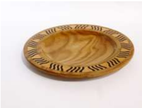
Robert DeHart – Sassafras & Maple Walnut Plate