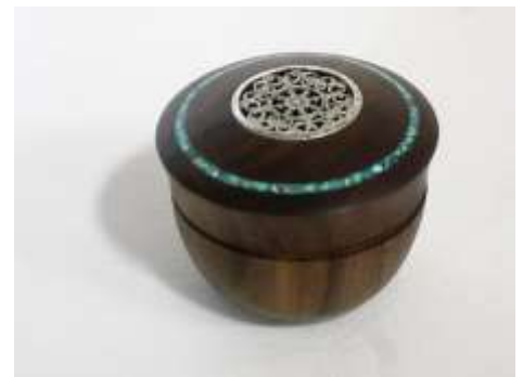
Nim Batchelor – Walnut Hand Box