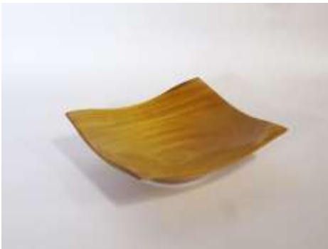
Jim Yarbrough – Osage Orange