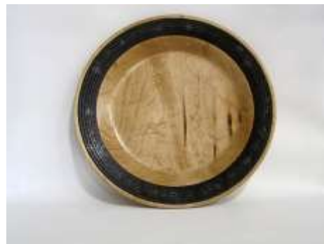
Nim Batchelor – Maple Platter