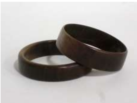
Jim Barbour – Walnut Bangles