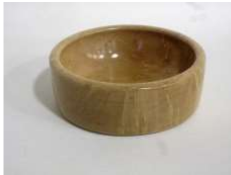
Jim Yarbrough – Bird's Eye Maple