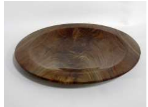
Doc Green/Harold Jones – Walnut Platter