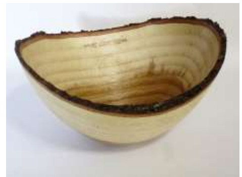
Dean Hutchins – Oak Natural Edge