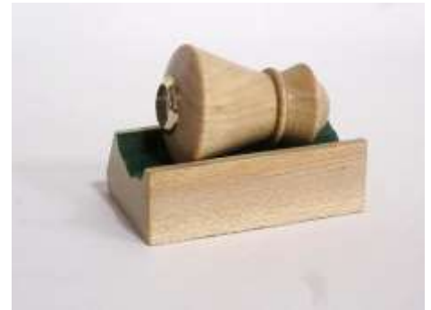
Jim Barbour – Maple Kaleidoscope