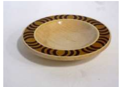
Robert DeHart – Sassafras, Maple, Walnut Plate