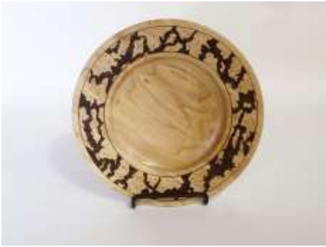
Kim Hutchins – Maple Saucer w/ Pyrography