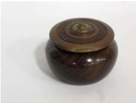
Bob Moffett – Walnut Box