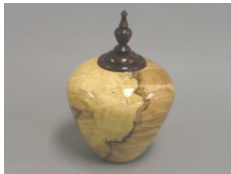
Earl Kennedy – Hollow Form