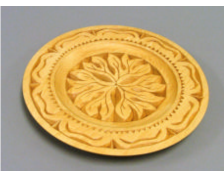
Vicki Tanner – Chip Carved Plate