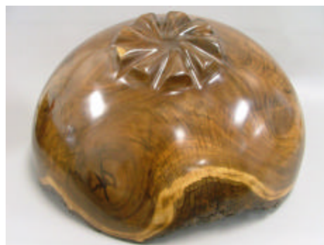
Earl Kennedy – Base of Walnut Bowl