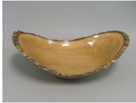
Gene Briggs – Pecan Natural Edge Bowl