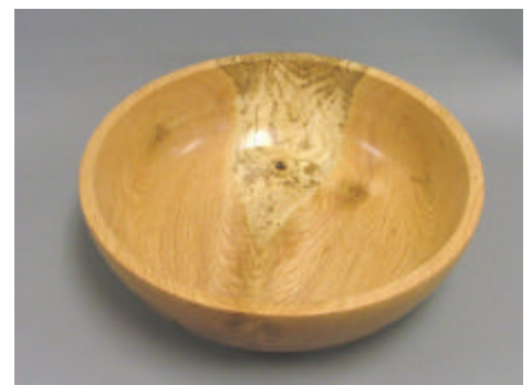
Dennis Ross – Oak Crotch Figured Bowl