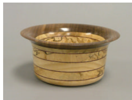
Bert Rau – Layered Bowl – Mixed Wood