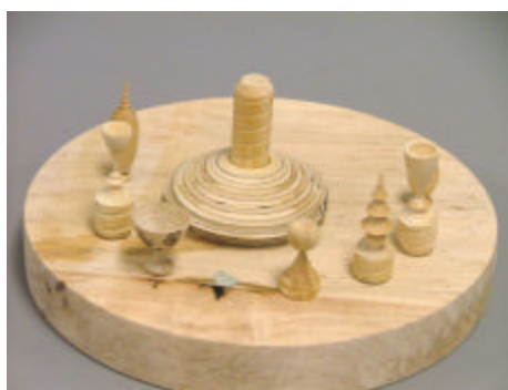
Earl Kennedy's challenge to turn items from 5/8 inch dowel pins.