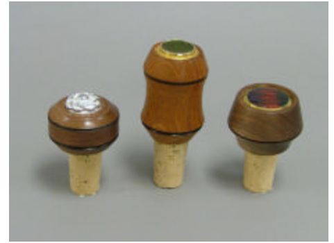
Jim Duxbury – Wine Stoppers with inserts