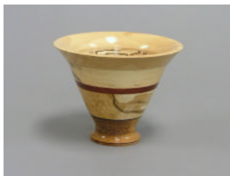
Bert Rau – Layered Bowl – Mixed Wood