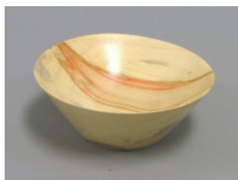
Jim Yarbrough – Box Elder Bowl