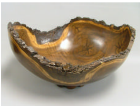
Earl Kennedy – Large Walnut Natural Edge Bowl