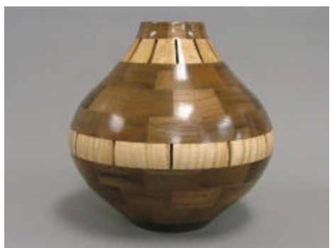
Jim Schoonard - Walnut/Maple Vessel