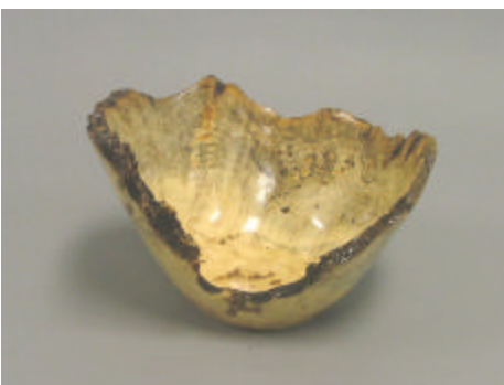
Bob Holtje – Maple Burl Natural Edge