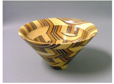
Jim Schoonard - Segmented Bowl 7.5" 11"