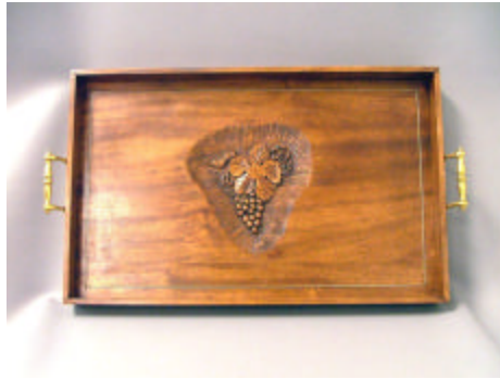
Ken Eastwood - Mahogany Tray (James River Woodcarvers)