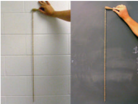
Earl Kennedy - 36 inch Spindle