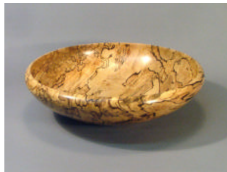
Jim Terry - Spalted Maple Bowl 12"