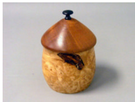
Joan Reynolds - Lidded Box 3"D