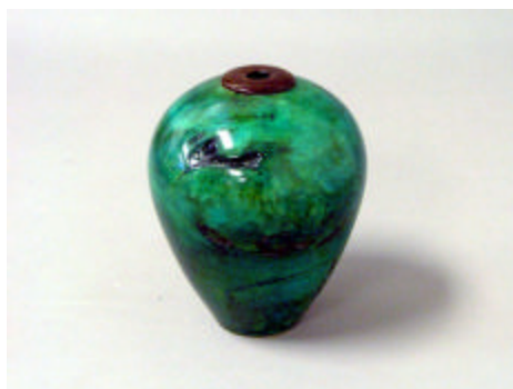
Lan Brady - Maple Vase 4"H