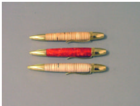
Gene Briggs - Plywood & Resin Pens