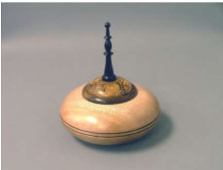
Earl Kennedy - Maple Box 5.25"D