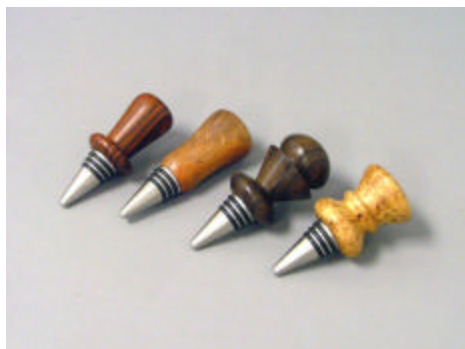
Jim Barbour - Bottle Stoppers