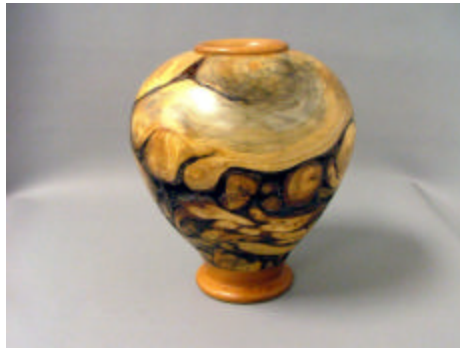
Earl Kennedy - Mugo Pine 7"D