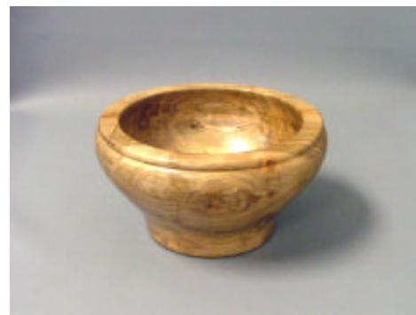
Chet Greathouse - Spalted Maple Bowl 7.5"