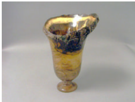
Earl Kennedy - Walnut Vase 7.5"H