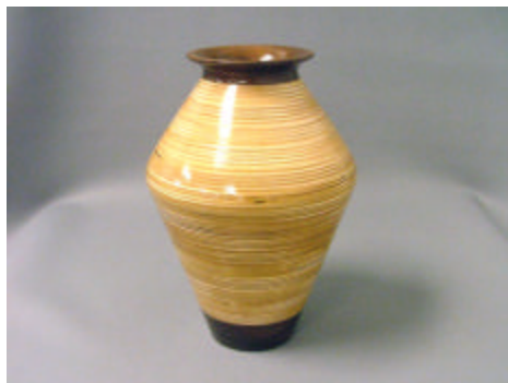
Gene Briggs - Plywood & Walnut Vase 9"H