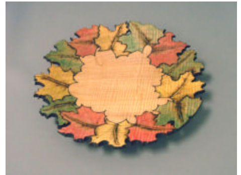
Vicki Tanner - Maple Wall Hanging 11"