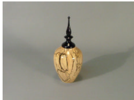
Jim Terry - Spalted Maple 2.75"D