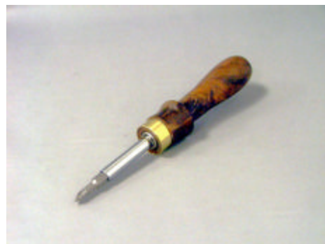
Jim Yarbrough - Walnut Screwdriver