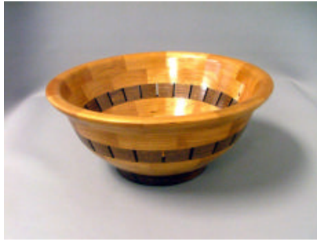
Jim Schoonard - Walnut & Cherry Bowl 11"