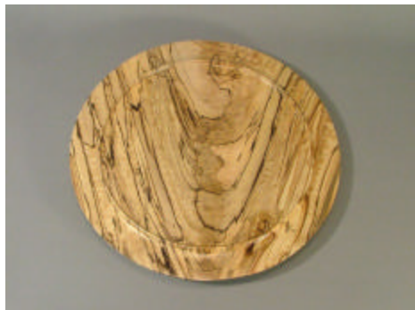
Jim Terry - Spalted Maple Platter 13"