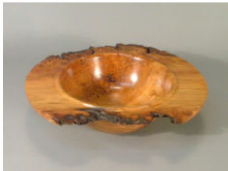
Jim Terry - Cherry Burl Bowl 10"