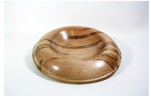
Jim Terry – 10” Ambrosia Maple Plate