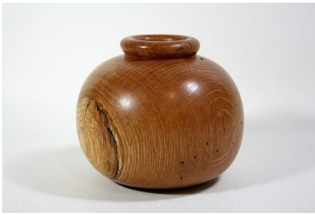
Milt Transou – 5' Oak Hollow Form