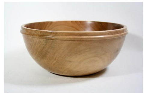
Milt Transou – 10” Maple Bowl