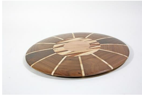
Bob Schasse - 8” Walnut Playground Frisbee