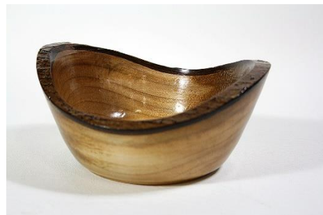
Jay Mullins - 5” Natural Edge Maple Bowl