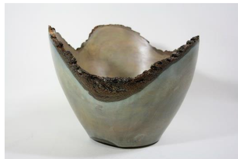
Harry Sample – 8” Natural Edge Bradford Pear Bowl, Color Tint