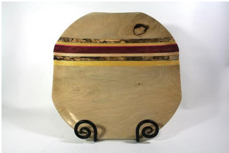
Earl Martin - 16” Holly Plate