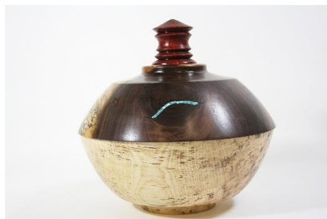
Jeff Clark - - Spalted Sweet Hackberry Walnut and Padauk Lidded Bowl