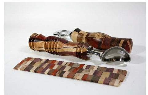
Jeff Clark – Ice Cream Scoop, Bottle Opener and sample glue up