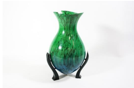
Jim Terry – 10” Spalted Maple Vase