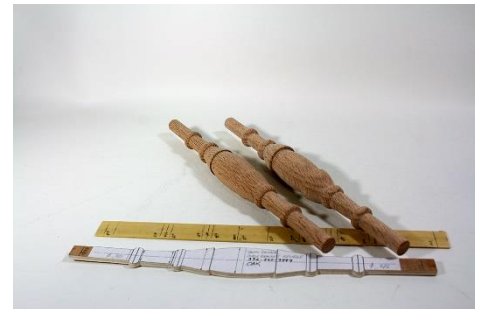
Dave MacInnes – 12" Red Oak Spindles, 2 of 12 for 1910 house