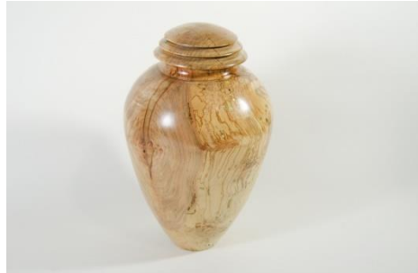
Jim Terry – 10” Maple Lidded Vase w/ Brass Fill