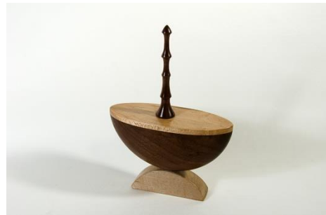
Jim Yarbrough – 6” Maple/Walnut Split Bowl