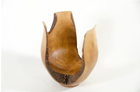
Jim Terry – 5” Dogwood Crotch