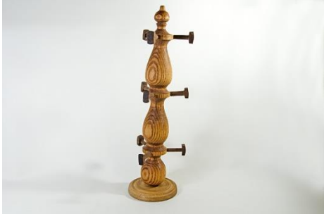
Dave MacInnes – 18” White Oak Cup Holder