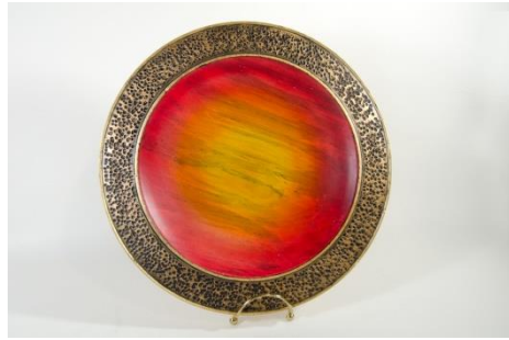
Jim Terry - 12” Maple Colored & Textured Platter