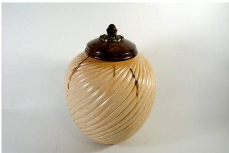
Brian Guhman – Maple/Walnut Hollow Vessel