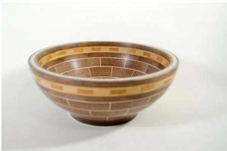
Bob Schasse – 10” Yellowheart, Maple, Walnut, Beech & Seashell