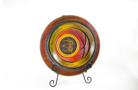
Bob Moffett – 14” Offset Platter