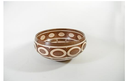
Bob Schasse – 10” Walnut/Maple Bowl