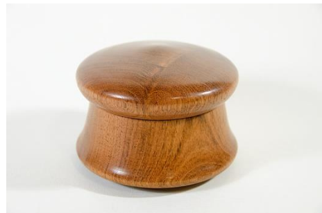
Ray Schwartz – 5” Bazilian Cherry Box