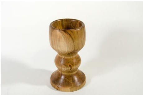
Jim Yarbrough – 7” Ambrosia Maple Chalice