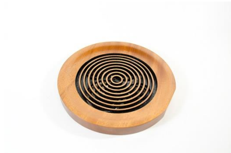
Jim Duxbury - 8” 12 Center Piece