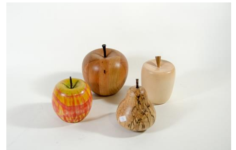
President’s Challenge – “Fruit”