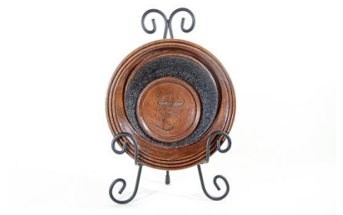
Bob Moffett – 9” Offset Platter