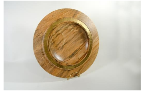
Jim Terry – 13” Maple & Gold Leaf Platter