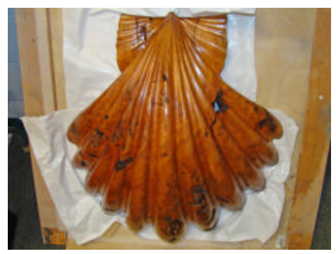
Casey Gloster - Cherry Burl Carved Scallop Shell