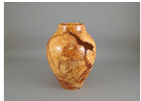
Alfred Thomas - Oak Burl Vase