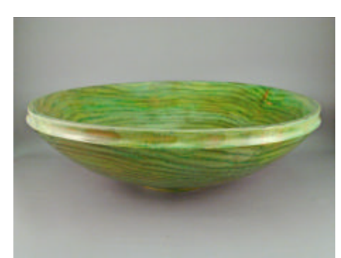
Earl Kennedy - Green Bowl