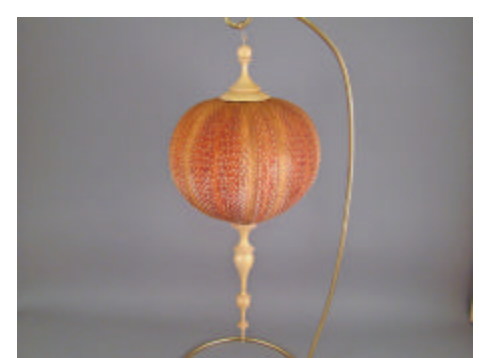
Jim Terry - Large Sea Urchin Ornament