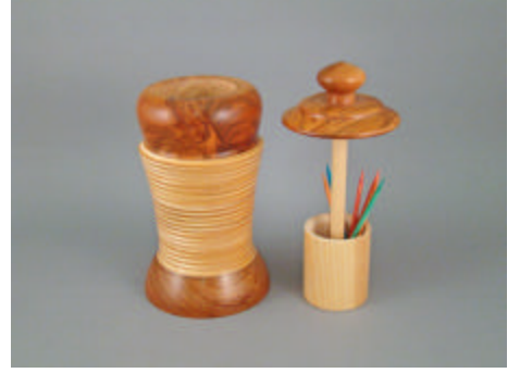
Gene Briggs - Cherry & Plywood Toothpick Holder