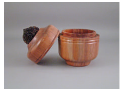
Carter Deaton - Walnut Threaded Box