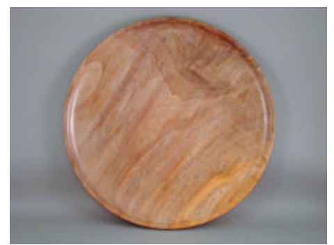
Carter Deaton - Walnut Platter