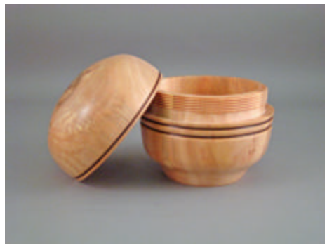
Carter Deaton - Dogwood Threaded Box