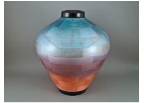
Jack Walters - Maple Segmented Vase