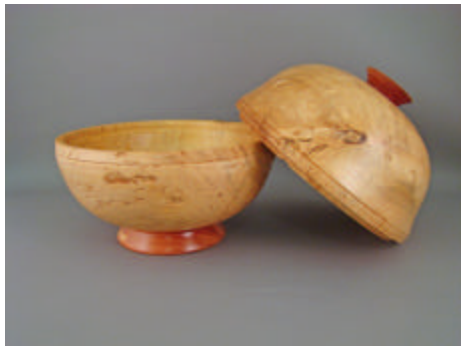
Doc Green - Willow Lidded Bowl