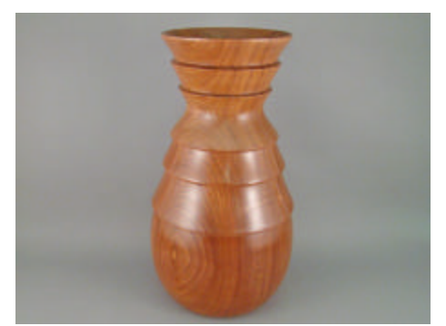
Gene Briggs - Walnut Vase