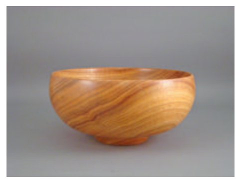
Carter Deaton - Canary Bowl