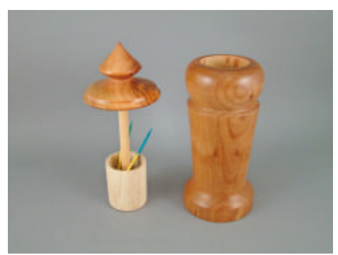
Gene Briggs - Cherry Toothpick Holder