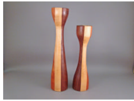
Dave MacInnes -Walnut/Maple/Tigerwood Candlesticks