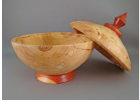
Doc Green - Willow Lidded Bowl