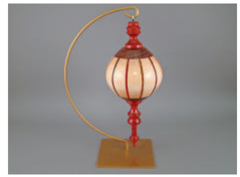
Jack Walters - Maple Walnut Cherry Bloodwood Ornament