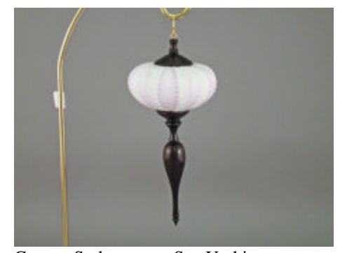
George Sudermann - Sea Urchin Ormament Ebony Finial