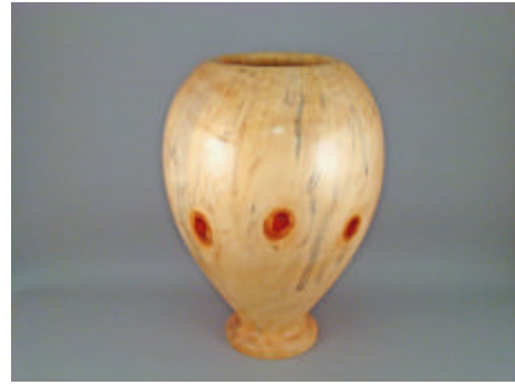
Earl Kennedy - White Pine Vase