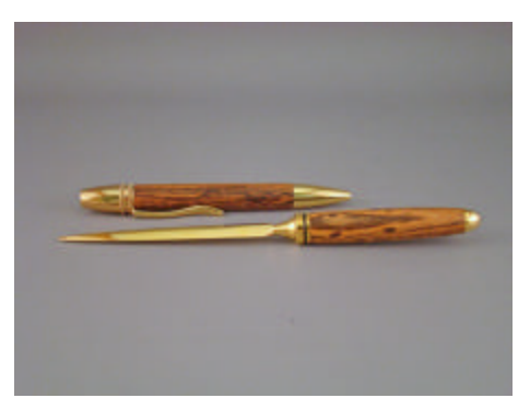
Jim Yarbrough - Bocote Pen & Letter Opener