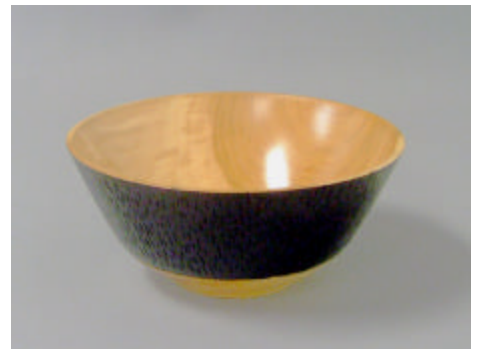
Bob Moffett – Cherry Bowl, Dyed & Textured Side – 7”