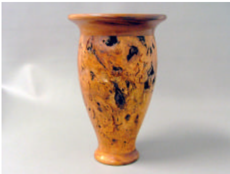
Earl Kennedy – Vase – 10.5”