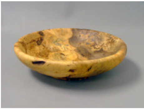
Jimmy Tuttle – Mistletoe Bowl – 12.5”