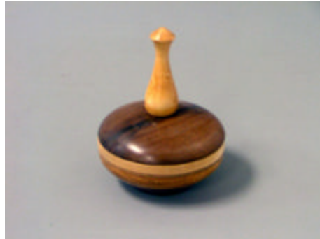
Jim Schoonard – Lidded Box – 4”H