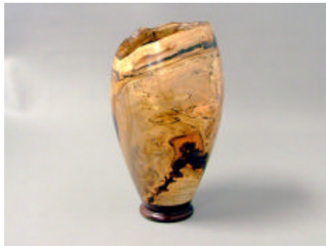
Earl Kennedy – Vase – 9”