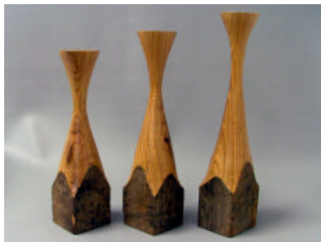
Jon Cowgill – Oak Vases – 12”, 13”, 14”