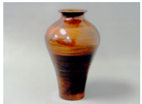
Gene Briggs – Walnut Vase