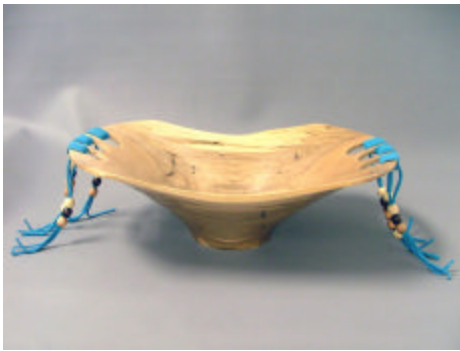
Roy Fisher – Maple Bowl – 14”