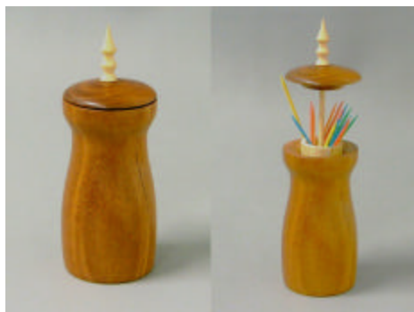
Gene Briggs – Mahogany Toothpick Holder