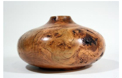
Geoff Purser – 9” Cherry Burl Hollow Form