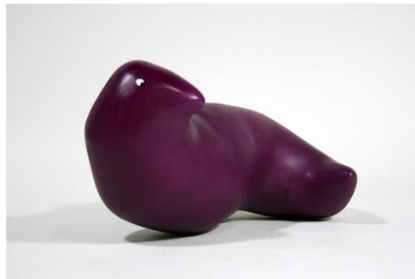
Geoff Purser – 6” Box