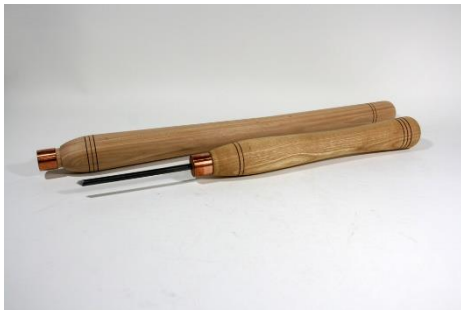
Phil Heinz – Oak/Hickory Tool Handles