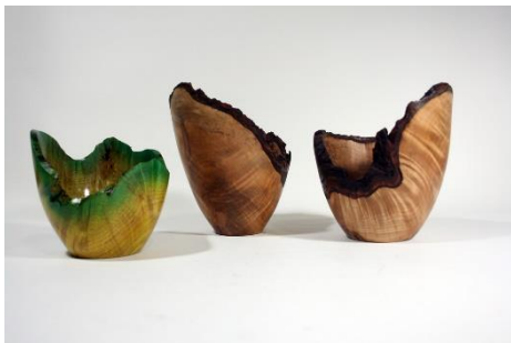
Steve Coley – Set of 3 Apple Natural Edge Vessels