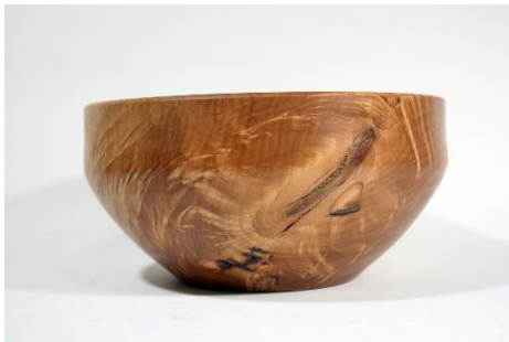
Jim Yarbrough – 9” Norway Maple Vase