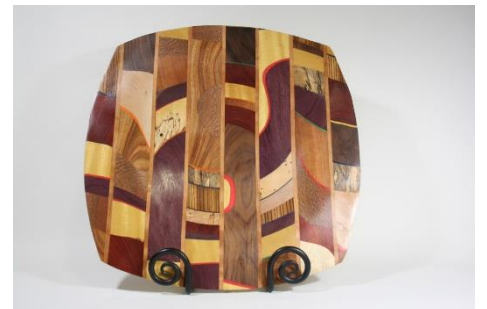
Earl Martin – 16” Plate