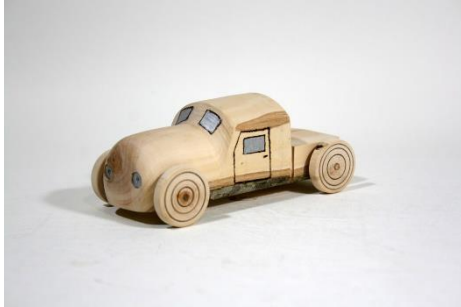
Bob Schasse – 5” Red Bud Toy Pick Up Truck