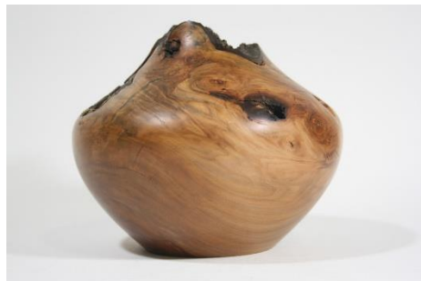
Steve Coley – 8” Apple Natural Edge Vessel