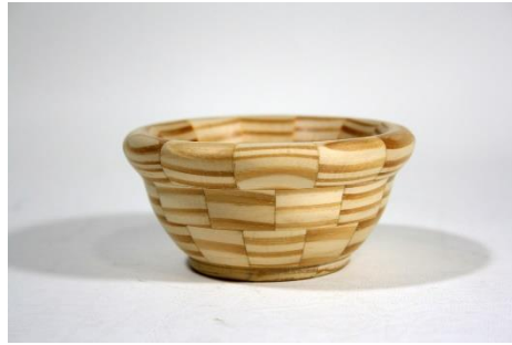
Luke Shepherd 4” Pallet Segmented Bowl