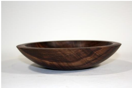
Phil Fuentes – 7” Walnut Bowl