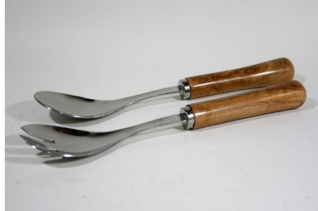
Jim Yarbrough – 10” Salad Serving Set