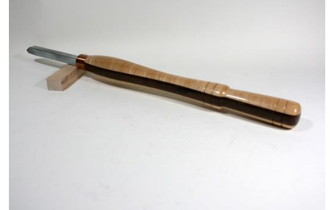
Steve Coley – 16” Maple/Walnut Turning Tool