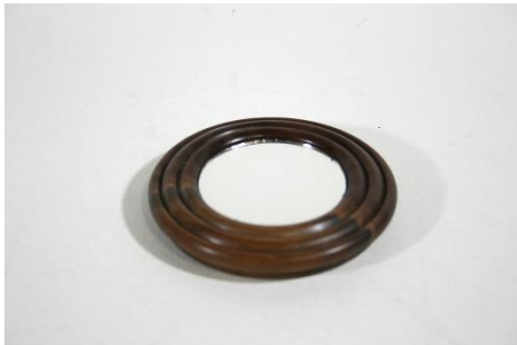
Earl Kennedy - Mirror