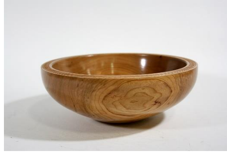
Rita Duxbury – 9” Cherry Bowl