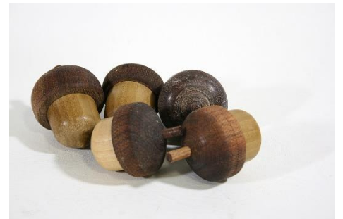
Earl Martin – Poplar & Walnut Acorns