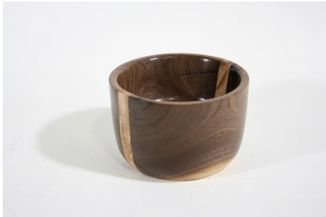
Lonnie Nagle – Black Walnut & Birdseye Maple