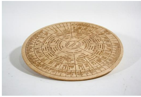
Nim Batchelor – 8” Maple Ancestry Platter