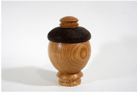
Jim Barbour – “Elon” Oak Acorn