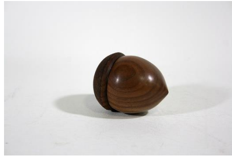
Nim Batchelor – Walnut Acorn