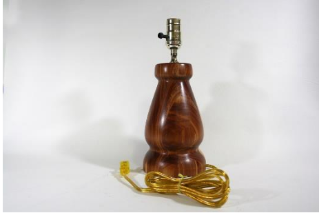
Luke Shepherd – 11” Red Cedar Lamp