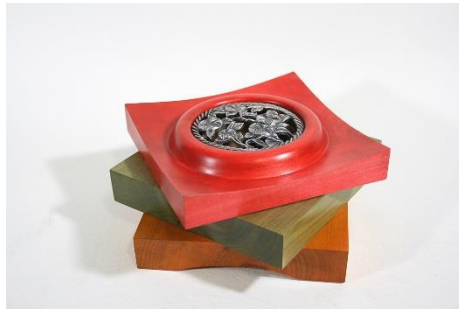
Earl Kennedy - Potpourri Bowl