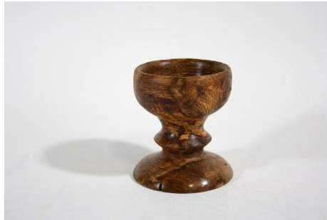
Jim Yarbrough – Scarlet Oak Chalice