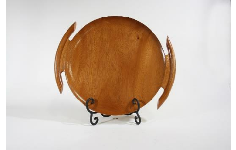
Jim Duxbury – 12” Sapele Platter