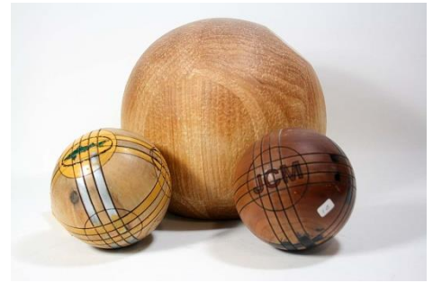
Jim Barbour – Hickory, Cherry & Poplar Balls