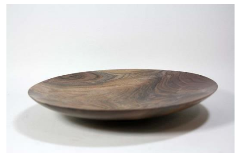
Jeff Clark – Black Walnut Platter