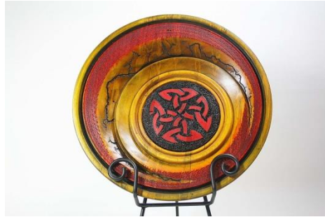
Bob Moffett – 10” Offset Maple Platter