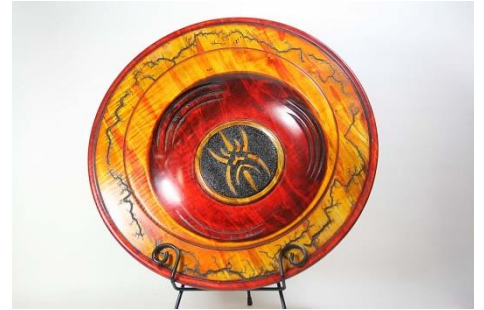
Bob Moffett – 16” Offset Maple Platter