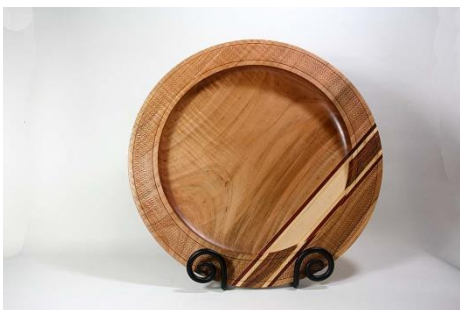
Earl Martin – 15” Curly Maple Platter