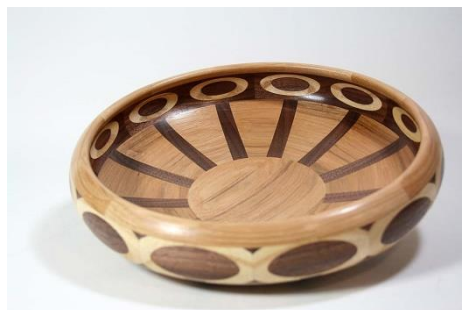
Bob Schasse 11” Hickory/Walnut/Ash Segmented Bowl