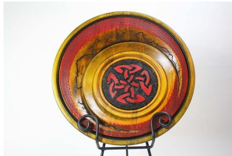
Bob Moffett – 10” Offset Maple Platter