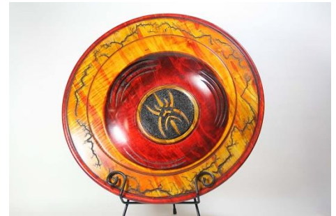
Bob Moffett – 16” Offset Maple Platter