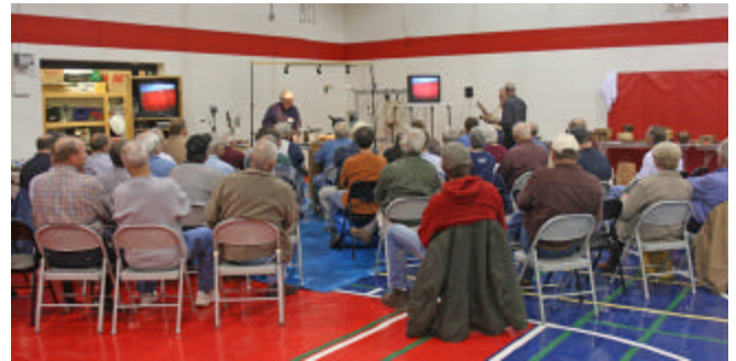
Our New Setup in the Gym