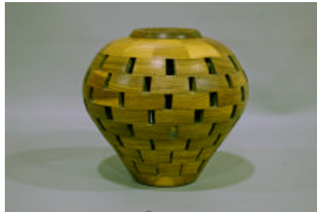
Jeff Clark – Walnut Open-Segment