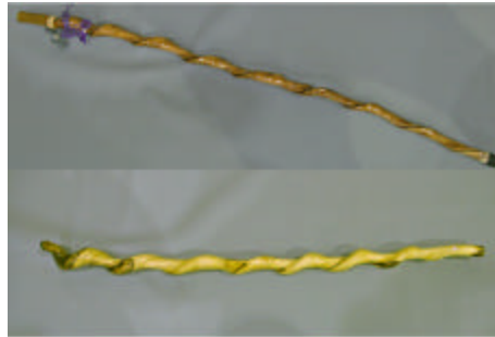
Paige Cullen – Walking Sticks