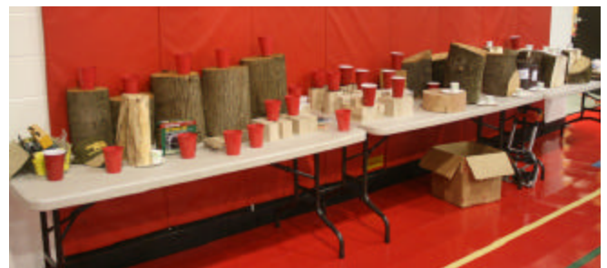
A Large Raffle