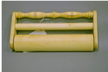
Clyde Mosley – Maple Rolling Pin