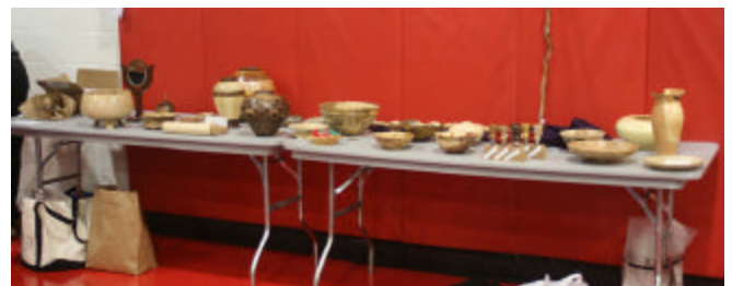
The Instant Gallery