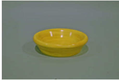
Jim Yarbrough – Osage Orange Bowl