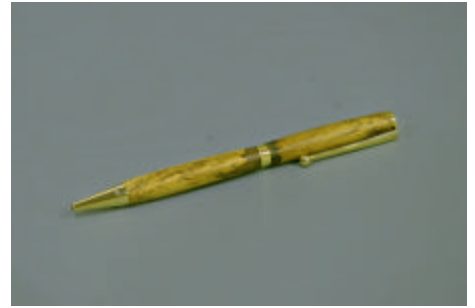
Jim Yarbrough – Dogwood Root Pen