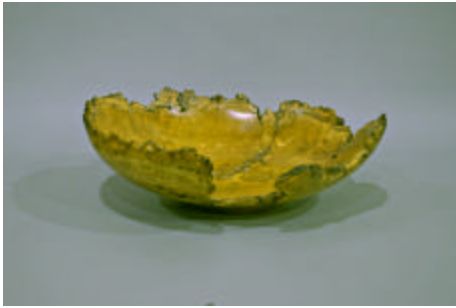
Edgar Ingram – Oak Burl Natural Edge Bowl