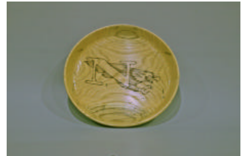
Bruce Schneeman – Oak Platter