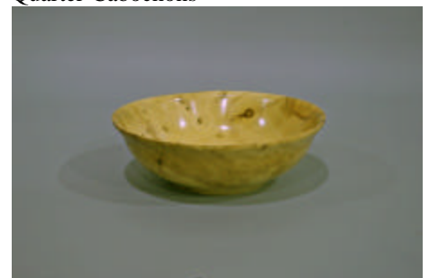
Edgar Ingram – Apple Small Bowl