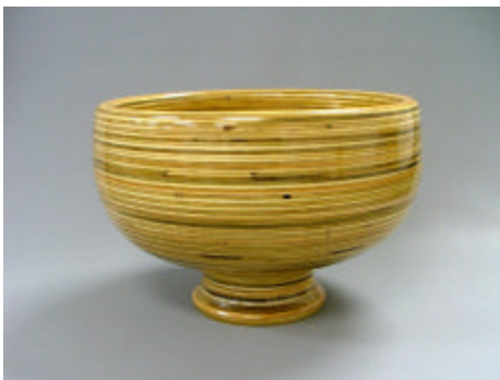
Earl Kennedy - Plywood Bowl