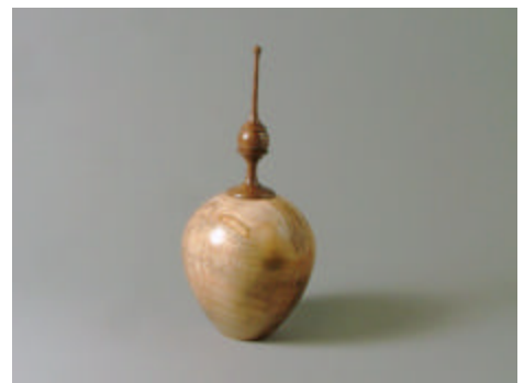
Jim Terry - Maple Hollow Form