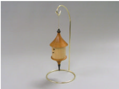
Wayland Loflin - Mahogany, Maple & Ebony Ornament