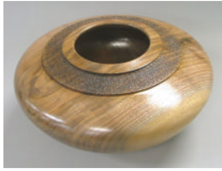
Bob Moffett - Walnut Bowl (Showing Detailing)