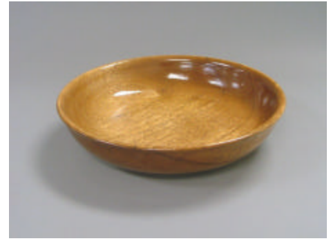
Gene Briggs - Mahogany Dish