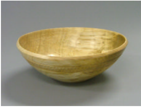
Lan Brady - Birch Bowl