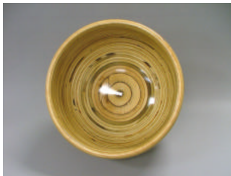
Earl Kennedy - Plywood Bowl - Inside