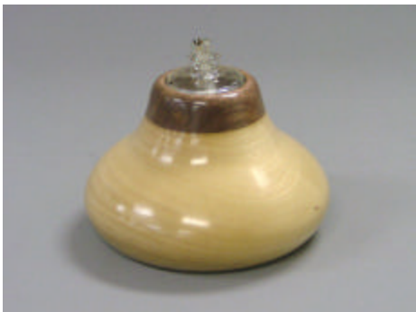
Bert Rau - Poplar Oil Lamp