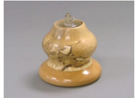
Bert Rau - Spalted Sycamore Oil Lamp