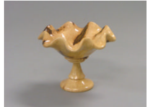
Earl Kennedy - Wavy Goblet