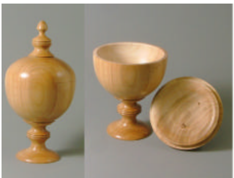
Jim Terry - Cherry Lidded Box