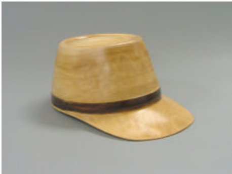
Earl Kennedy – Cap