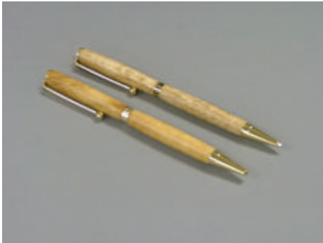
Jim Yarbrough - Olive & Spalted Maple Pens