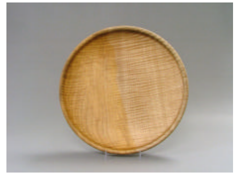
Roy Fisher - Tiger Maple Shallow Bowl