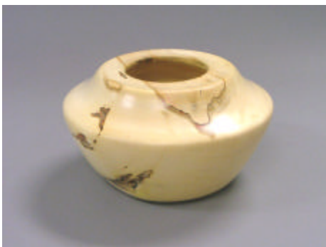
Bruce Schneeman - Box Elder Semi-Closed Bowl