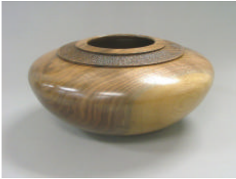
Bob Moffett - Walnut Bowl