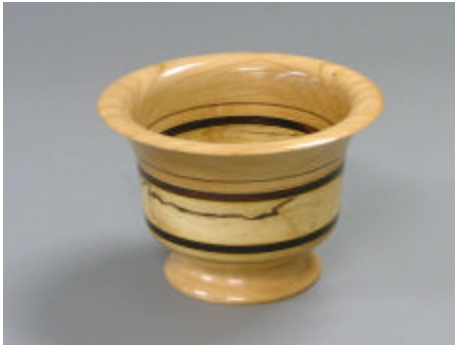
Bert Rau - Cherry, Exotic & Spalted Sycamore Vase