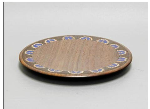
Julien McCarthy – 8” Inlaid Walnut Plate