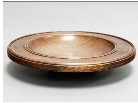
Bob Moffett – Walnut Platter