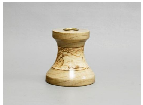
Bert Rau – Spalted Sycamore Candlestick