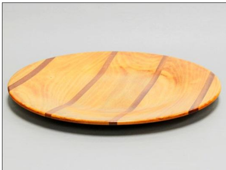
Floyd Lucas – Poplar Platter