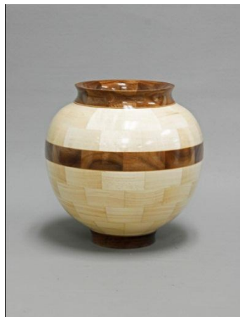
Dean Hutchins – Walnut/Maple Segmented Vase