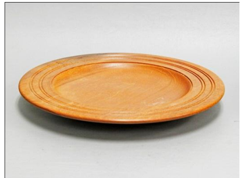
Lan Brady – Mahogany Platter