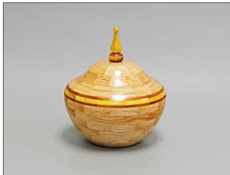
Floyd Lucas – Oak Lidded Bowl