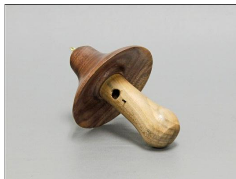
Jim Yarbrough – Walnut/Maple Birdhouse Mushroom