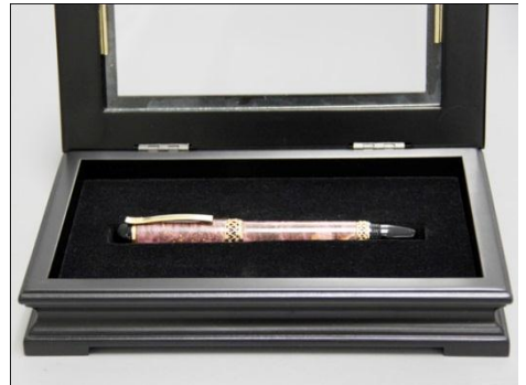
Scot Conklin – Buckeye Burl Apollo Pen