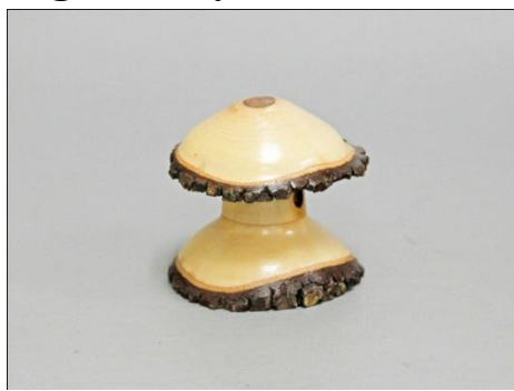
Carter Deaton – Threaded Dogwood Mushroom