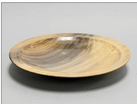
Doc Green – Poplar Platter