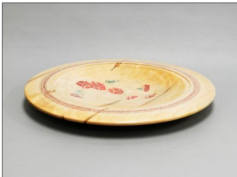
Lan Brady – Maple Platter