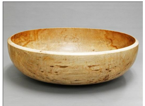
Pat Lloyd –Large (20”+) Sugar Maple Bowl