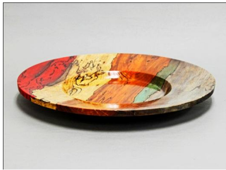
Earl Kennedy – Colored Pecan Platter