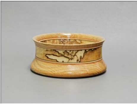
Bert Rau – Oak & Spalted Sycamore Bowl