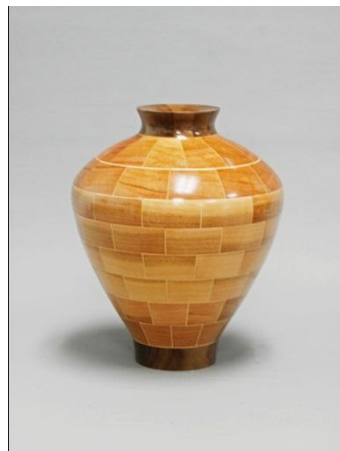
Dean Hutchins – Cherry/Maple Segmented Vase