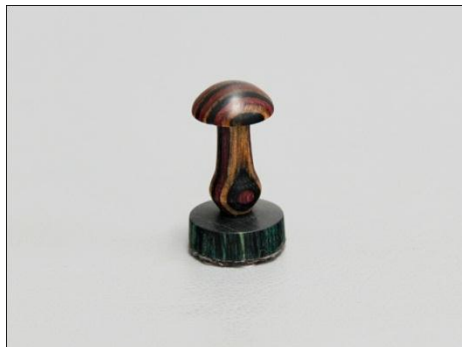
Scot Conklin – Dymondwood Mushroom