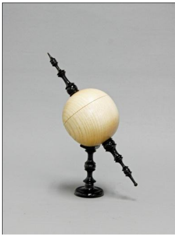
Wayland Loftin – Ash & Ebony Lidded Box