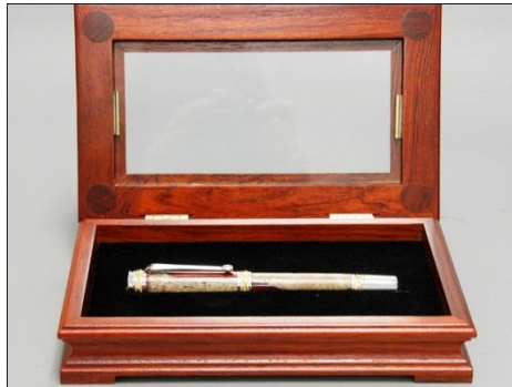
Scot Conklin – Burl & Acrylic Majestic Pen