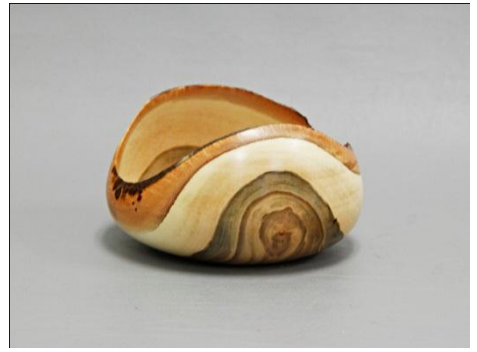
Tom Ogburn – Maple Bowl