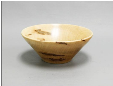
Jim Yarbrough – 8” Ambrosia Maple Bowl