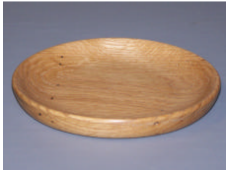
Jim Yarbrough, Oak Platter