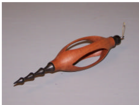
Wayland Loftin, Ebony & Mahogany "Inside Out Turned" Ornament