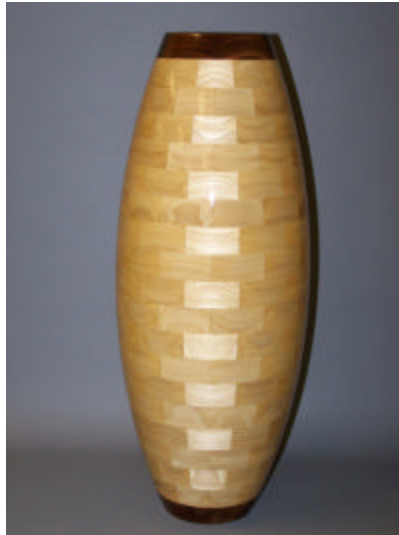
Glen Marceil, Poplar & Walnut Closed Segment