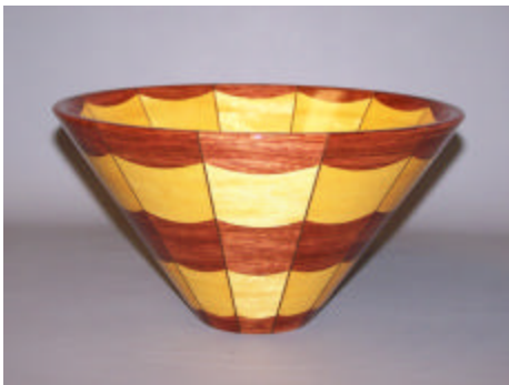
Glen Marceil, Bubinga, Yellowheart & Walnut Segmented Bowl