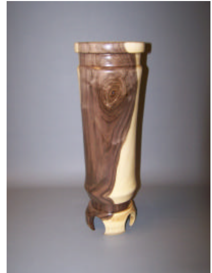
Bruce Schneeman, Walnut Vase