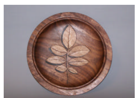
Vicki Tanner Bleached & Burned Walnut Plate