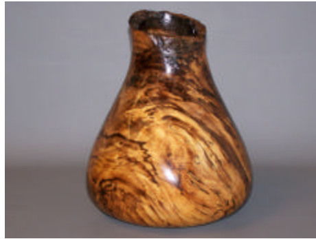
Earl Kennedy, "Volcano" Vase