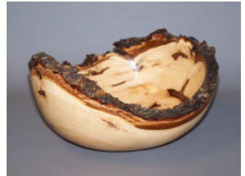
Earl Kennedy, Natural Edge Pecan Bowl