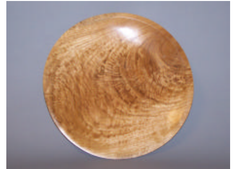
Bob Moffett, Oak Platter