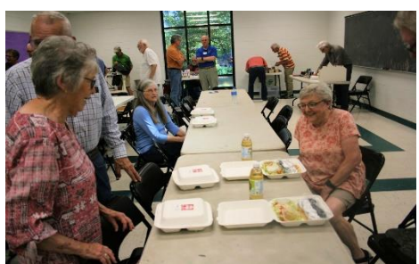
Everyone enjoying their meal.