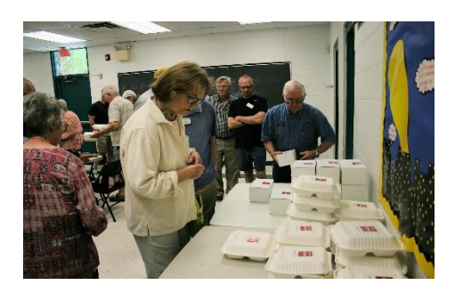
A boxed meal was provided by the club.