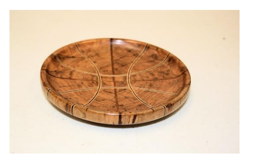
Dish – Multiple Woods – Jason Lathrop