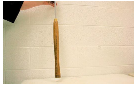
Tool Handle - Shedva