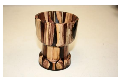
Cup-Cedar\ and\ Resin-Fran\ Bass