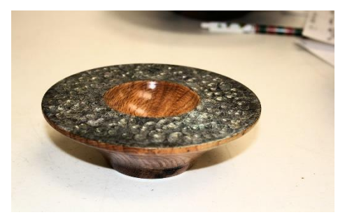
\begin{array}{l} Painted \ Textured \ Bowl - Oak - Bob \\ Moffett \end{array}