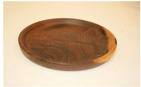
Plate - Roy Carlson - Walnut