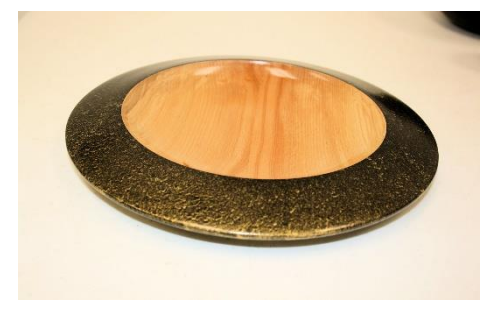
Platter - Beech - Jason Lathrop