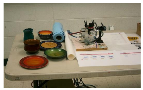
Air Brush Demo table – Jim Terry