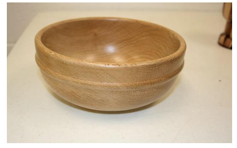
Bowl - White Oak - Bob Schasse