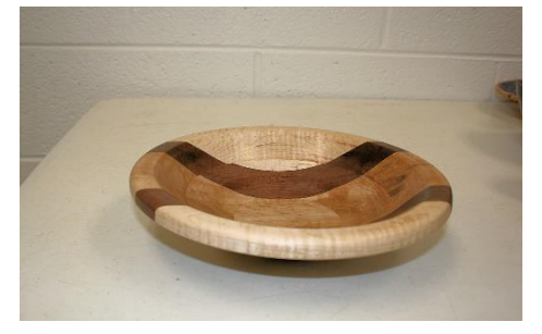
Bowl - Various Wood - Nick Poschl