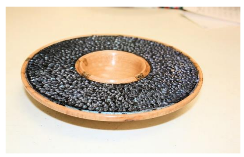
Blue Textured Bowl – Maple – Bob Moffett