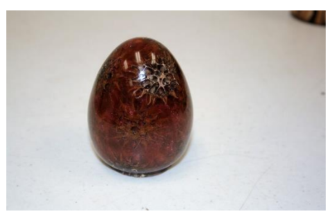
Egg – Resin - Fran Bass