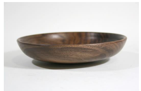
Crystal Earley – Figured Walnut Bowl