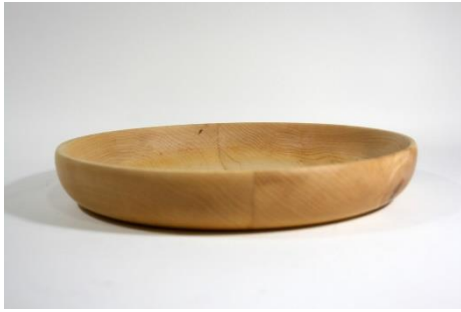
Crystal Earley – Maple Cheese Platter