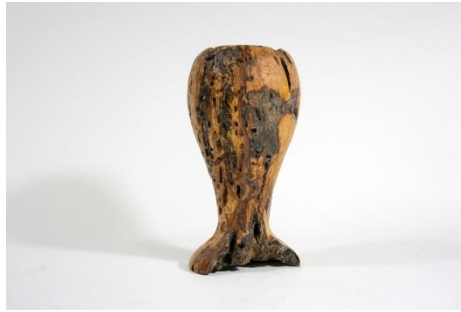
Jim Yarbrough – 6” Oak Burl Hollow Form