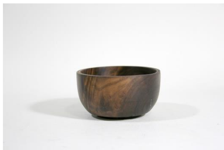
Crystal Earley – Walnut & Brass Shavings Bowl