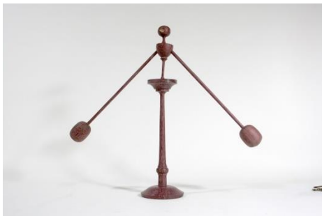
Phil fuentes – Purpleheart Toy