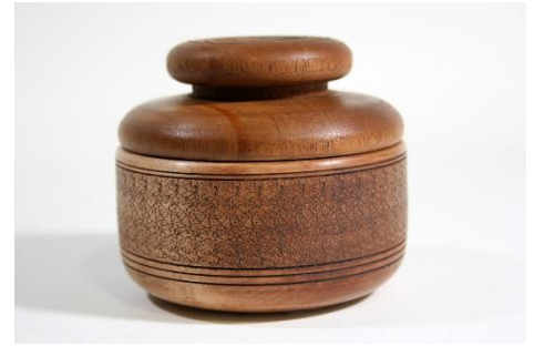
Jerry Jones – Walnut/Maple Box