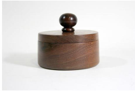
Jim Yarbrough – Walnut Box