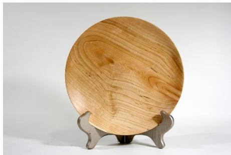
Harry Sample – 8” Cherry Plate