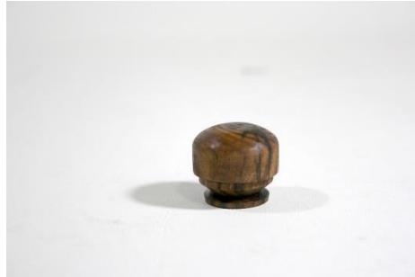
Harry Sample – Walnut Box