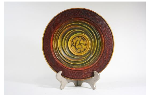
Bob Moffett – 9” Maple Offset Platter