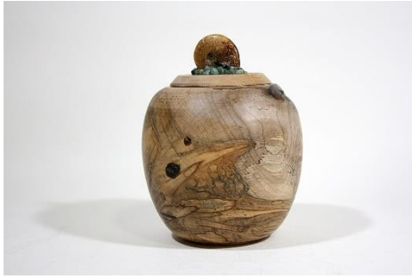
Crystal Earley – Turner-of-the-Month 6” Maple Burl, Sycamore Vessel