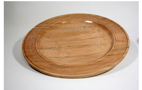
Jimmy Murray – 17” Spalted Maple Platter