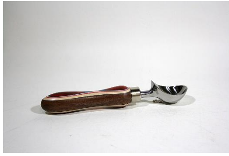
Bob Schasse – Ice Cream Scoop