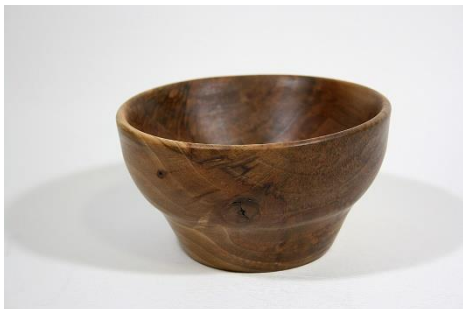
Jim Yarbrough – 6” Maple Bowl