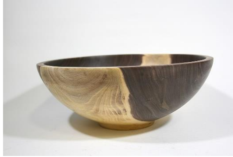
Scot Brown – Walnut Bowl