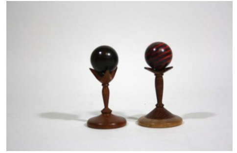
Earl Kennedy – Marbles & Stands