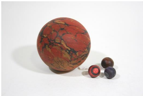
Dallas Stokes – Marbled Marble