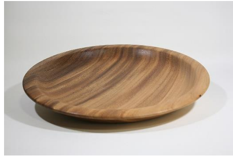
Dallas Stokes – Monkey Pod Platter