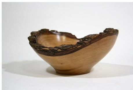
Earl Kennedy – Natural Edge Bowl