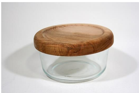
Earl Kennedy – Turned Lid Glass Bowl