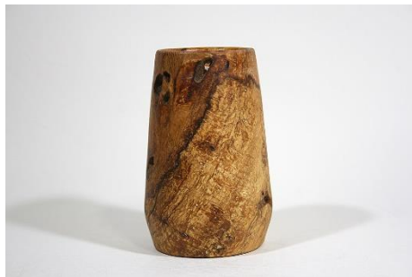
Jim Yarbrough – 6” Scarlet Oak Hollow Form