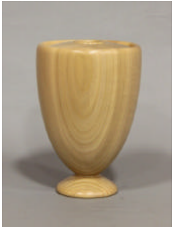
Earl Kennedy – Poplar Vase