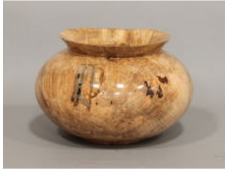
Red Saunders – Maple Burl Hollow Form