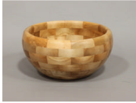
Floyd Lucas – Maple Segmented Bowl