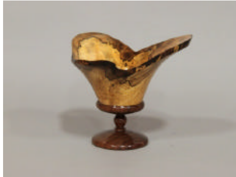
Earl Kennedy – Natural Edge Goblet