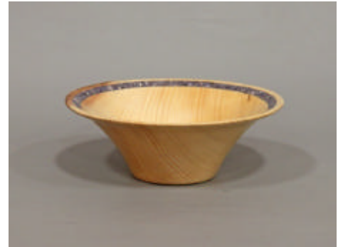
George Sudermann – Port Oxford Cedar, Blue Fluorite