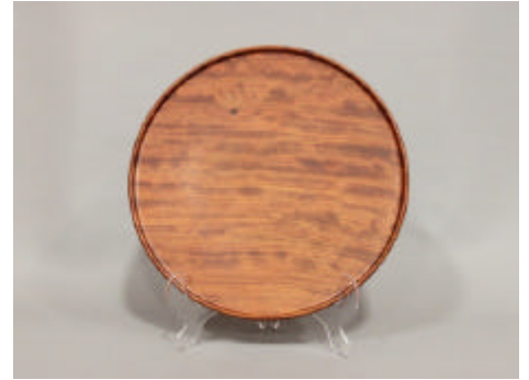
Clyde Mosley – Bubinga Platter