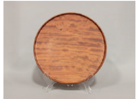
Clyde Mosley – Bubinga Platter