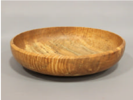
Pat Lloyd – Curly Spalted Black Maple Large Bowl