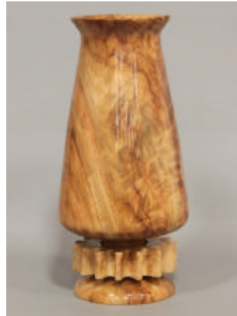
Red Saunders – Camphor Vase