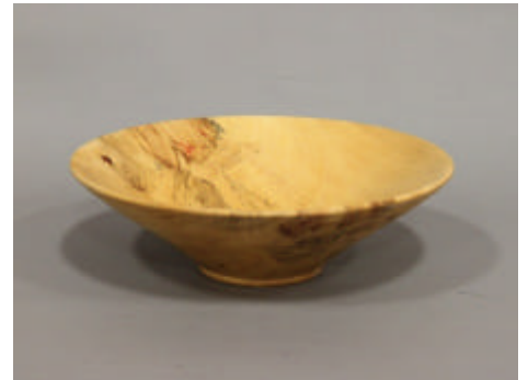
Jim Yarbrough – Box Elder Bowl