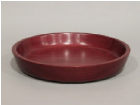
Clyde Mosley – Purple Heart Bowl