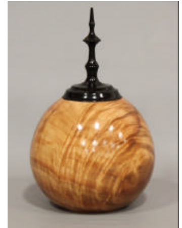
Red Saunders – Camphor Hollow Form