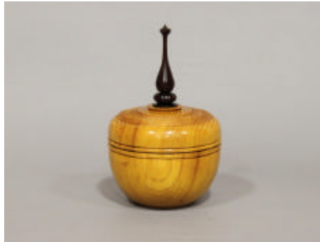
Bob Moffett – Osage Orange, Cocobola Finial Box