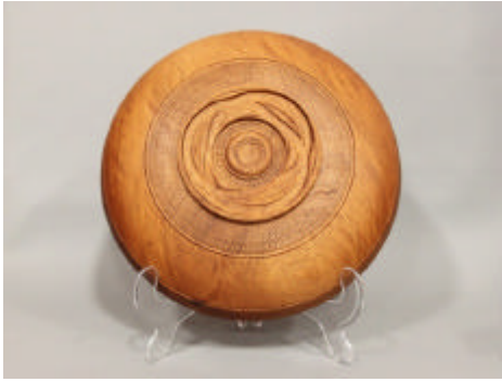
Butch Hadley – Mahogany Bowl (multi-axis four)