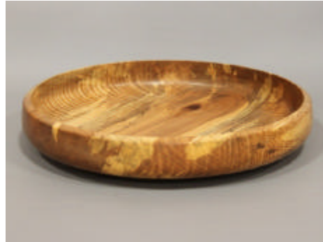
Pat Lloyd – Curly Spalted Black Maple Cookie Tray