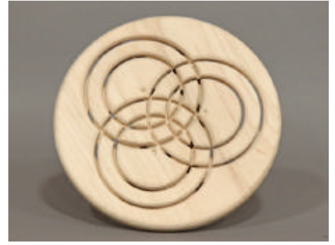
Earl Kennedy – Maple Trivet