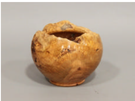
Doc Green – Small Cherry Natural Edge Bowl