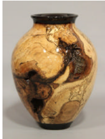
Clyde Jones – Willow Oak Burl Spalted Vase