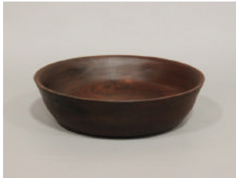
Jim Yarbrough – Walnut Bowl