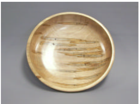
Jim Terry - Maple Bowl - view 2