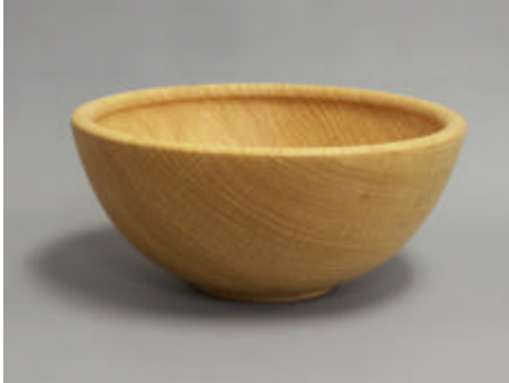
Dennis Ross - Black Oak Bowl