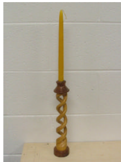
Eckess Jones – Spiral Candlestick