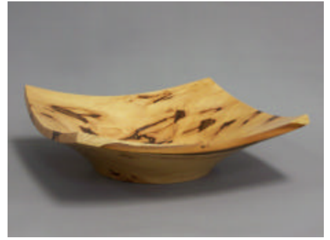
Earl Kennedy - Pecan Square Bowl