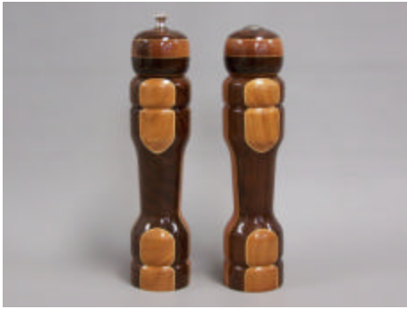
Gene Briggs - Walnut/Cherry Pepper Mill & Salt Shaker