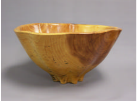
Earl Kennedy - White Pine Wavy Bowl