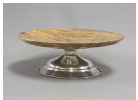
Julien McCarthy - Silver Footed Ambrosia Maple Bowl (view 2)