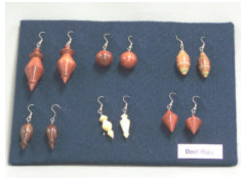
Bert Rau - Earrings