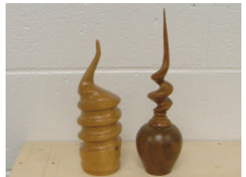
Eckess Jones - Pigtails