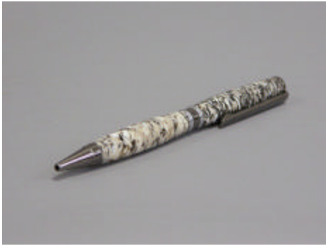
Earl Kennedy - Sea Shell Pen