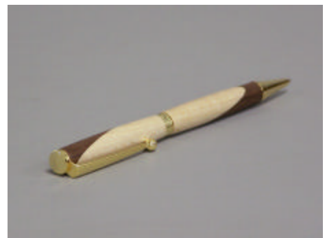
Jim Yarbrough - Walnut & Maple Pen