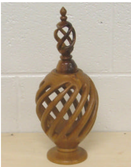
Eckess Jones – Spiral Vessel