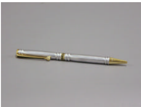
Gene Briggs - Turned Aluminum Pen