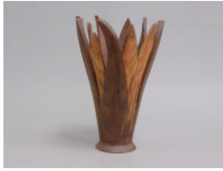
Vicki Tanner - Walnut Vase - Turned, Carved, Burned & Bleached