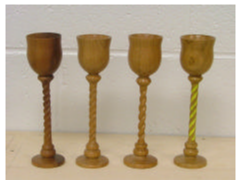
Eckess Jones - Spiral Stem Goblets