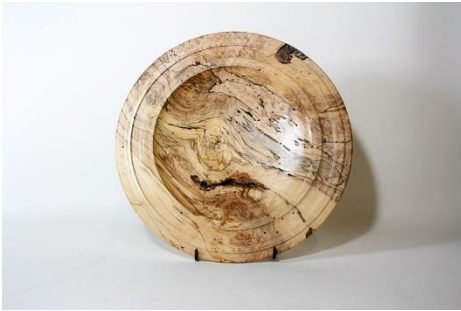
Jim Terry – 11” Maple Plate