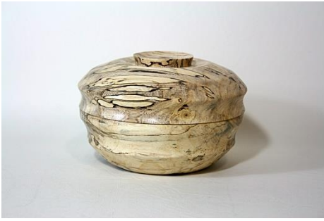
Jon Clark - 6" Hackberry Covered Bowl