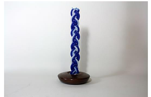
Tim Smith – 5” Walnut Candle Holder