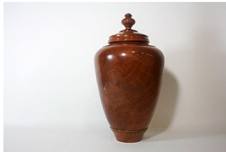
Brian Guhman – Redwood & African Blackwood Urn