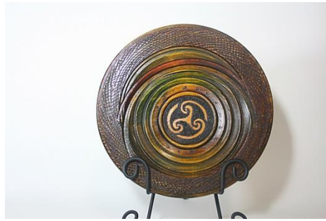
Bob Moffett – 9” Off Center Poplar Platter