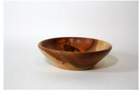
Jim Yarbrough – 4” Cherry Bowl