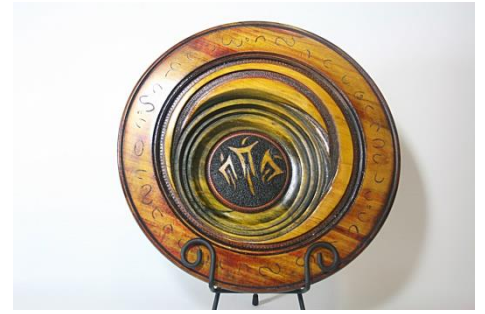
Bob Moffett – 13” Off Center Maple Platter