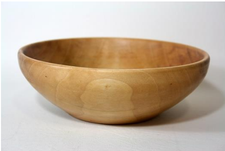
Jim Yarbrough – 8” River Birch Bowl