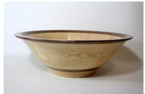
Bob Schasse – 14” Walnut & Ash Salad Bowl