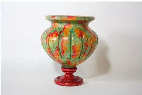
Earl Kennedy – Rubber Tree Colored Vase