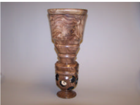
Bruce Schneeman - Walnut Vase w/ ball inside