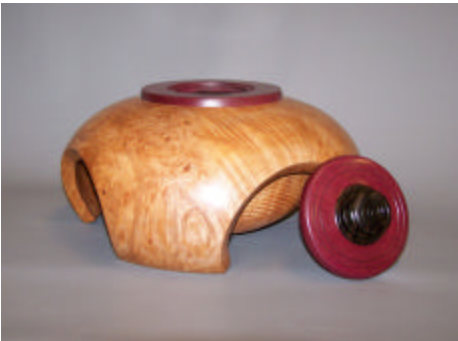
Roy Fisher - Maple Burl & Purple Heart