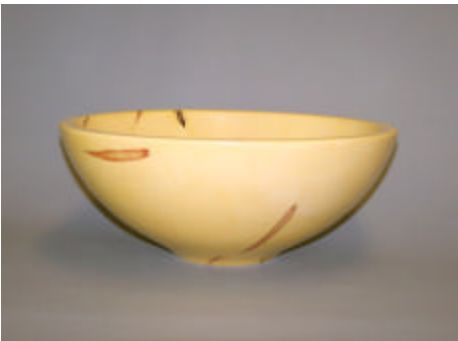
Mike Evans - Box Elder Popcorn Bowl