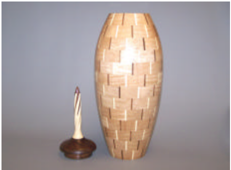
Glen Marceil - Maple/Walnut/Holly Vase