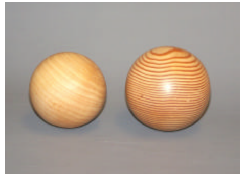
Jim Barbour - Maple & Fir Balls