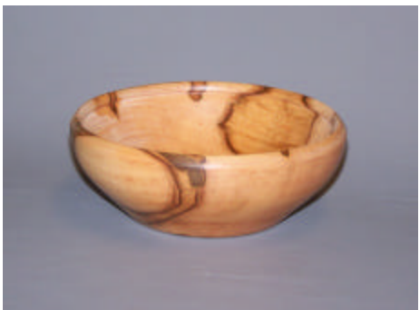
Jim Yarbrough - Maple Bowl (Candy)