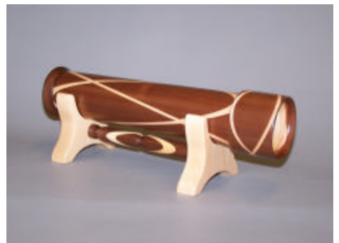
Jim Duxbury - Kaleidoscope