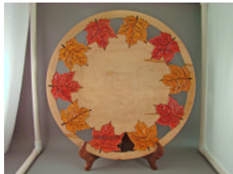
Red Saunders – Ambrosia Maple Platter