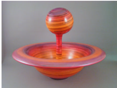
Doc Green – Plywood Ball