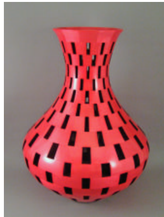
Jack Walters – Maple Open Segment