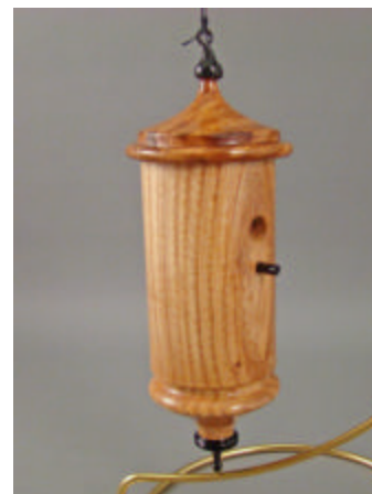
Wayland Loftin – Ash Ebony Oak Burl Birdhouse Ornament