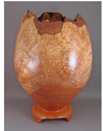
Red Saunders – Mtn. Elm Hollow Form