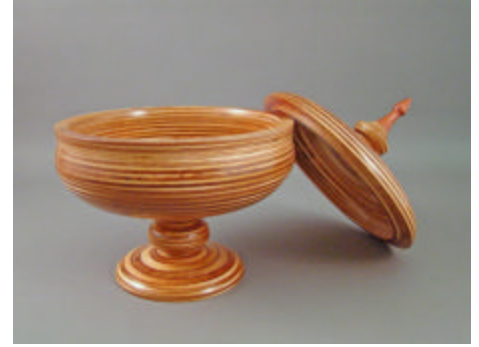
Floyd Lucas – Plywood Lidded Bowl