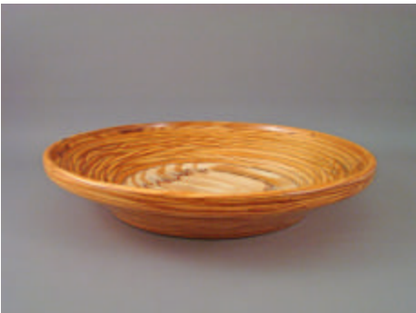
George Sudermann – Plywood Plate