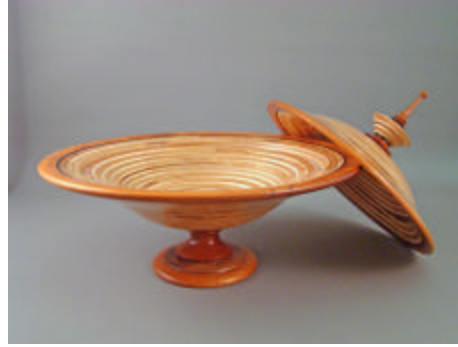
Earl Kennedy – Plywood Lidded Piece