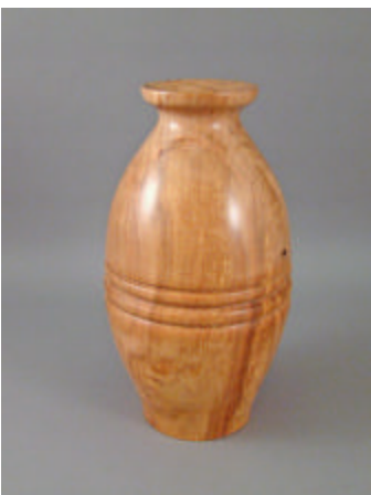
Jim Yarbrough – Maple Hollow Form