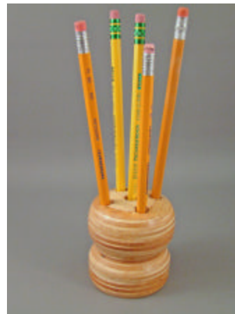
Jim Yarbrough – Plywood Pencil Holder