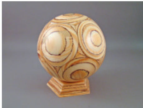
Clyde Mosley – Plywood Ball