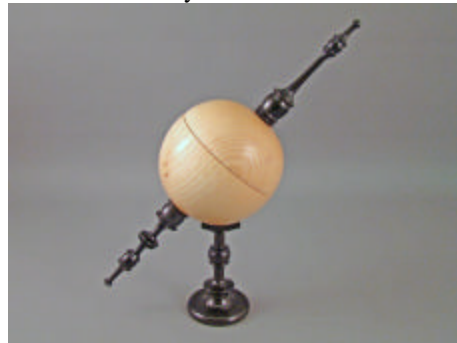
Wayland Loftin – Ash Ebony Lidded Box