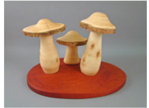
Clyde Mosley – Holly Mahogany Mushrooms