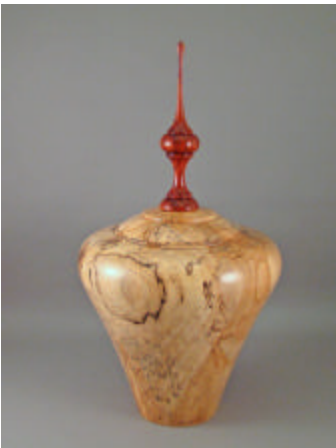
Bob Moffett – Maple Hollow Form Cocobolo Finial