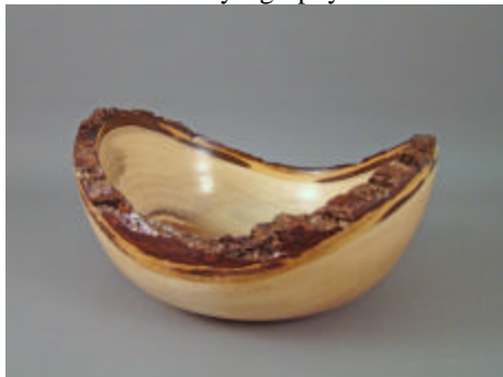
Floyd Lucas – Walnut Natural Edge Bowl