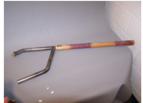
Bruce Schneeman, Hollowing Tool