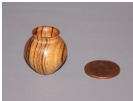
Lan Brady, Miniature Turning (3/4 inch)