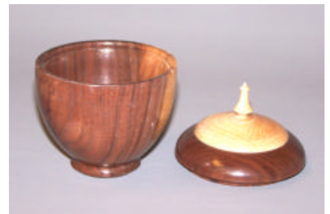
Bob Moffett, Walnut & Maple Box