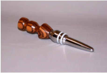
Paige Cullen, Zebrawood Bottle Stopper