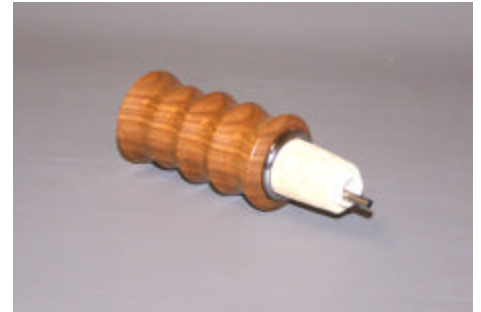
Paige Cullen, Butternut Pouring Spout