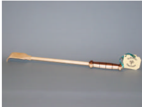
Jim Duxbury, Maple & Mahogany Back Scratcher