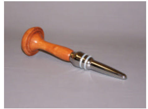
Paige Cullen, Redwood Bottle Stopper