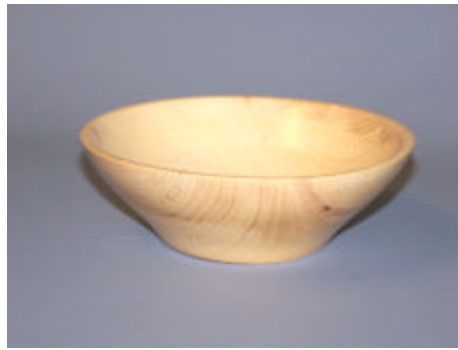
Paige Cullen, Box Elder Bowl