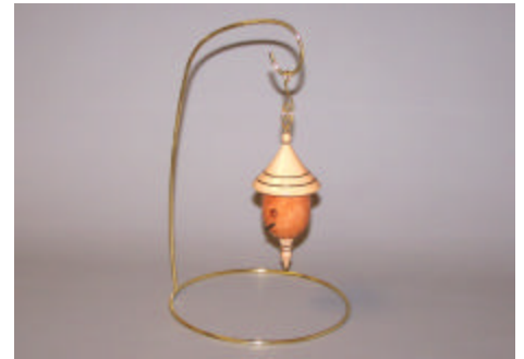
Butch Hadley, Briarwood & Maple Ornament