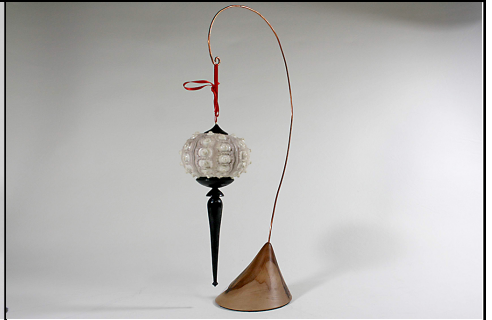
Dave Kelly - Sea Urchin