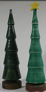
Carol Kanipe - Ploplar Trees