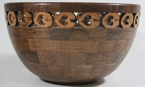
Steve Coley - Segment Walnut