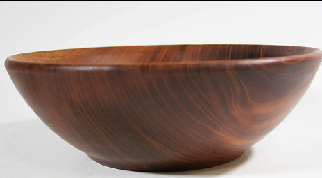
Jim Yarbrough - Bowl