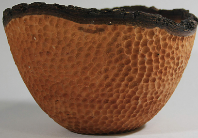
Steve Coley - Ntl Edge Texture