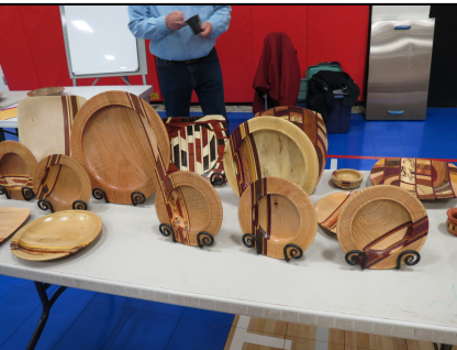
Earl's Demo Pieces