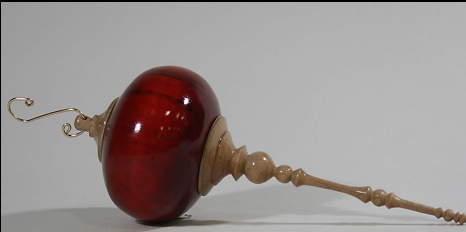
Geoff Tucson - Cedar/Maple