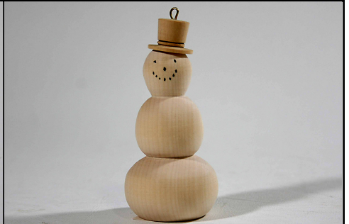
G.Sunderman - Snowman