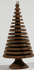
Carol Kanipe - Poplar Tree