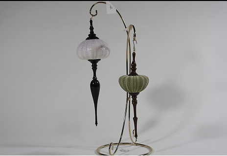
Bob Schasse - Sea Urchin