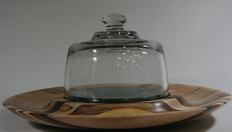
Jeff Clark - Cheese Platter