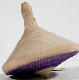
Noel Smith- Maple Top