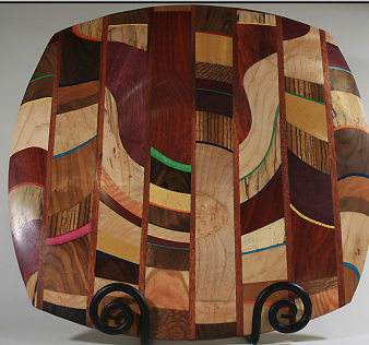
Earl Martin - Multi-wood Platter