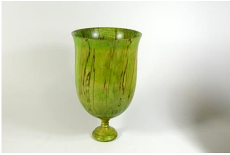
Earl Kennedy – Spalted Maple Vase