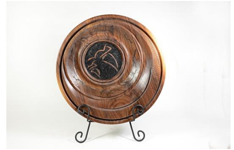
Bob Moffett – 14” Walnut Offset Platter