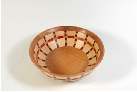
Bob Schasse – 6” Cherry, Birch, Redheart & Walnut Segmented Bowl