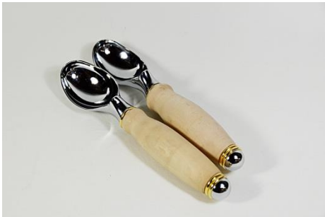
Colin Brown – Ice Cream Scoops