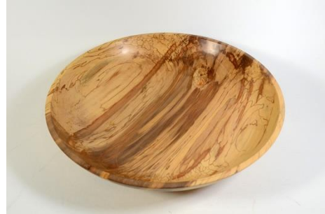
Bob Schasse – 13” Sweet Gum Bowl