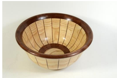
Bob Schasse – 9” Ash & Walnut Bowl