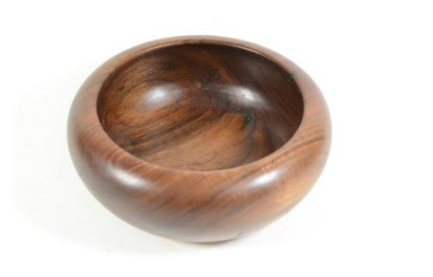
Jim Yarbrough – 7” Walnut Bowl