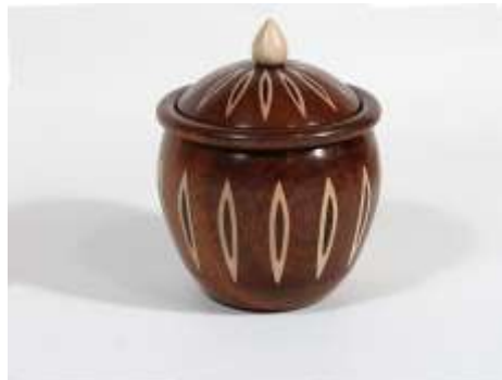
Earl Kennedy – 4” Mahogany & Maple Box