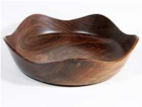
Jim Duzbury – 14” Walnut Bowl