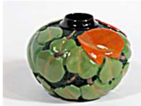
Red Saunders –Carved & Painted