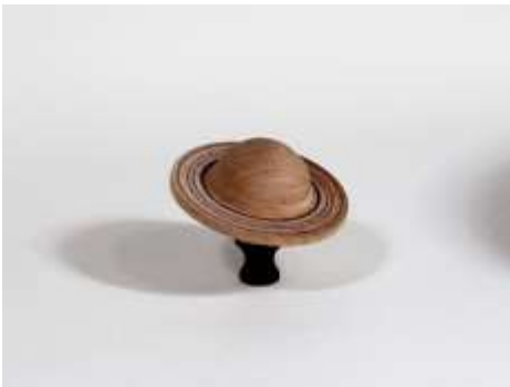
Dave MacInnes – Maple 7 Walnut Saturn