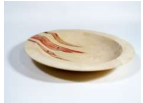
Geoff Purser – 11” Box Elder