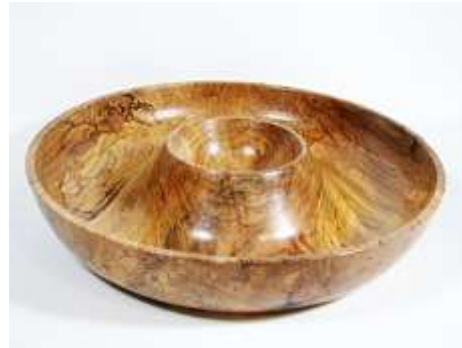
Milt Transou – 16” Black Maple Chip & Dip Bowl