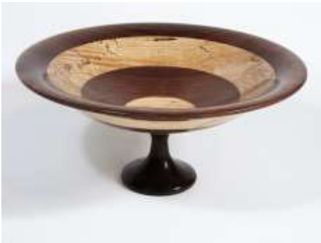
Earl Kennedy – 8” Walnut & Maple Stacked Ring Bowl