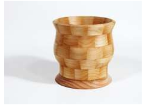
Frank Crotts – 5” Maple