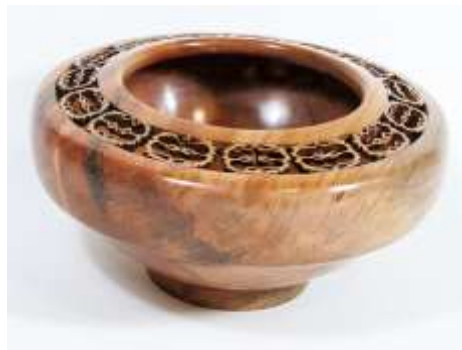
Julien McCarthy – 9” Maple w/walnuts