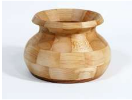
Frank Crotts – 5” Maple