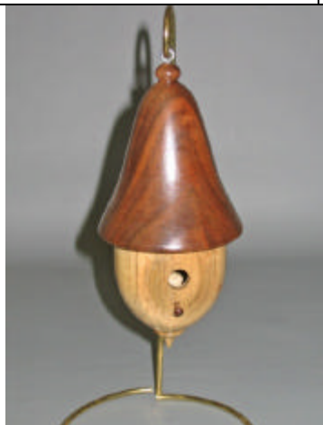
Bob Moffett – Walnut & Maple Ornament