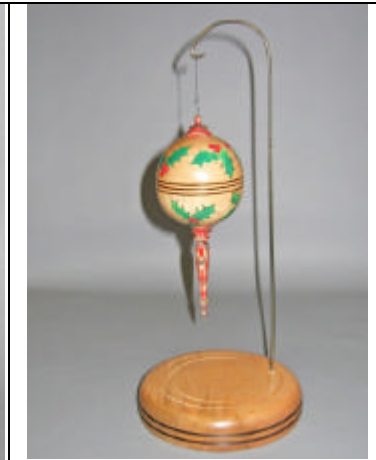
Earl Kennedy - Ornament