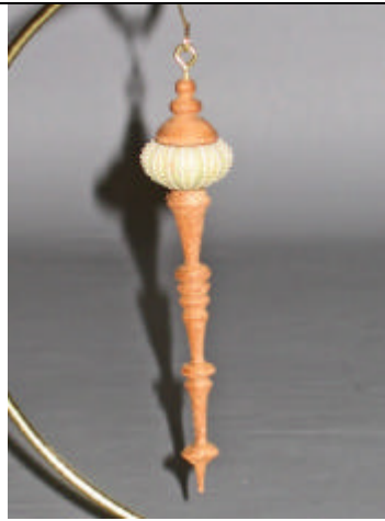
Nim Batchelor – Sea Urchin Mahogany Ornament