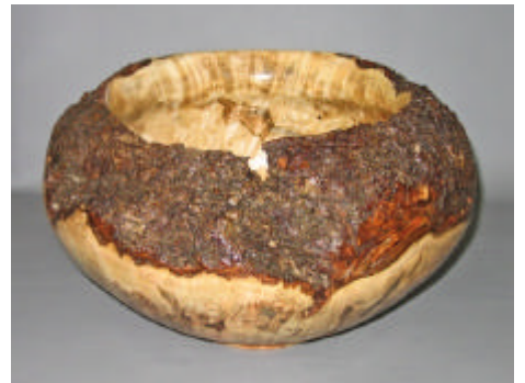
Carter Deaton – Maple Burl Natural Edge Bowl