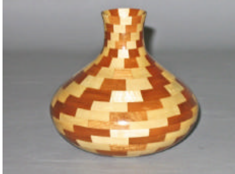
Floyd Lucas – Maple & Cherry Vase