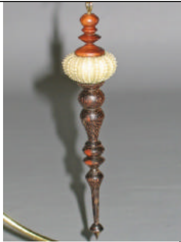
Jim Barbour – Sea Urchin Bubinga Ornament