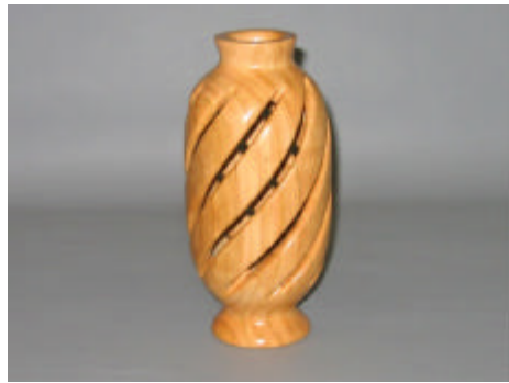
Carter Deaton – Cherry Spiral Vase