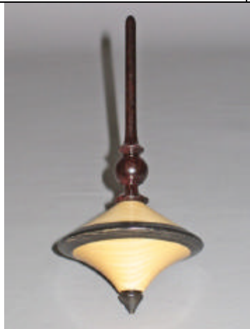
Wayland Loflin – Ebony & Ash Spinning Top