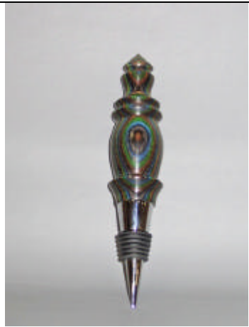
Gary Robinson – Diamond Wood Wine Stopper