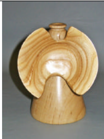
Jim Yarbrough – Maple & Ash Angle