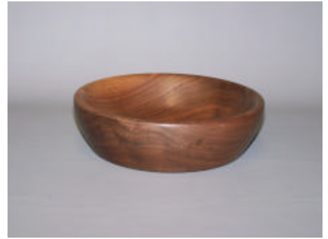
Rich Peters, Walnut Bowl – 5”