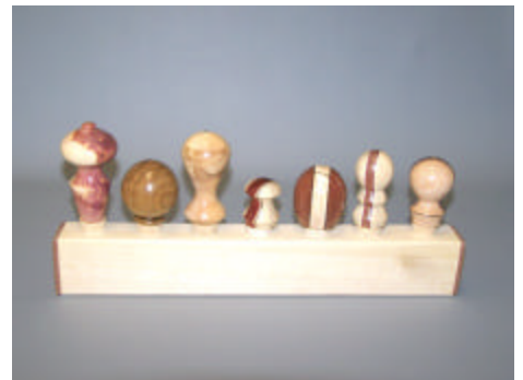
Bert Rau, Bottle Stoppers