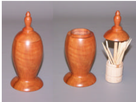
Earl Kennedy, Cherry Toothpick Holder