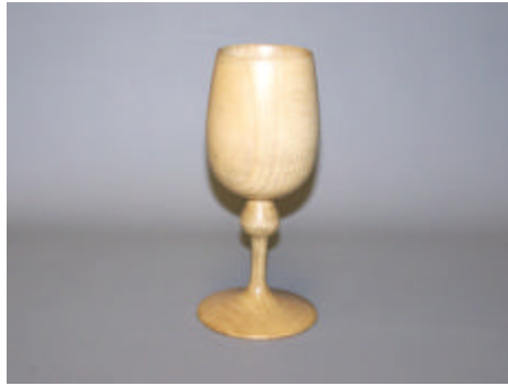
Rich Peters, Poplar Cup